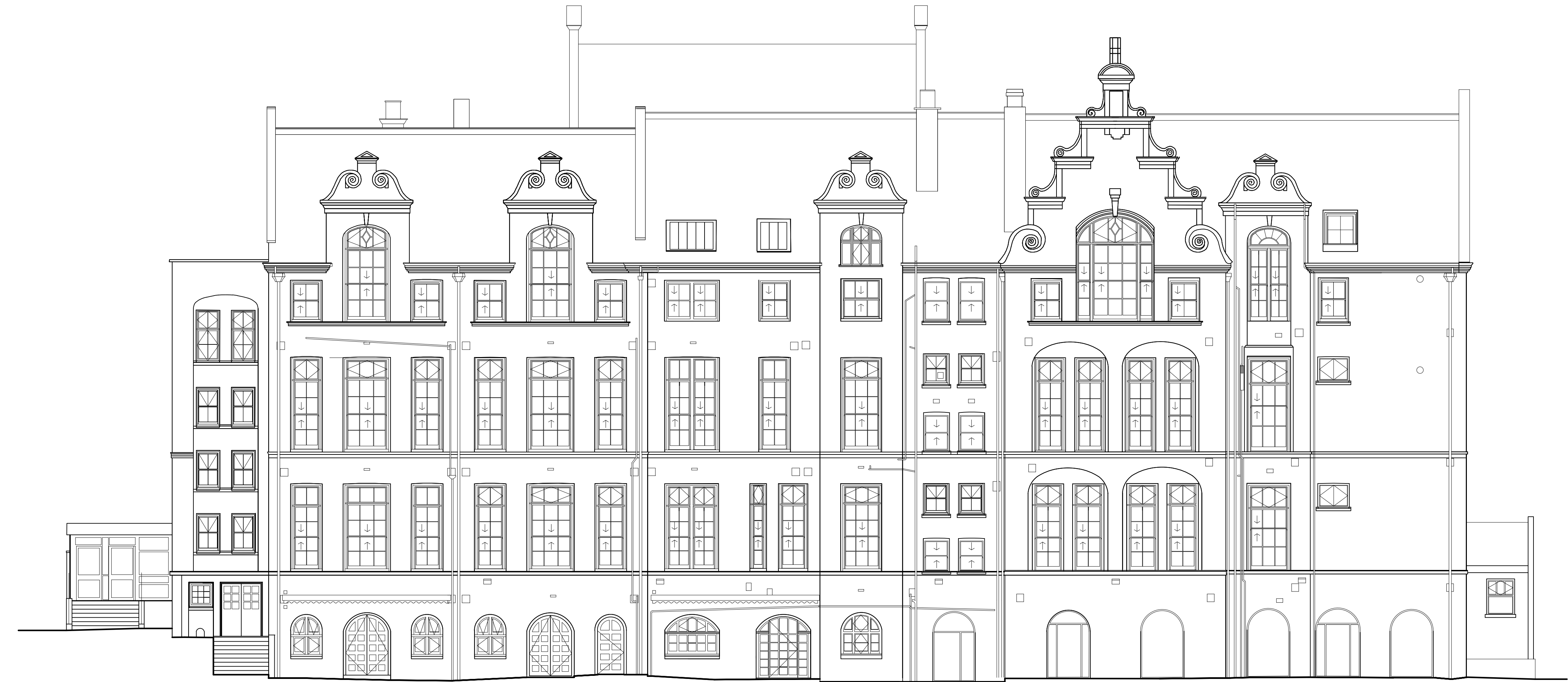
South East Elevation (Playground)