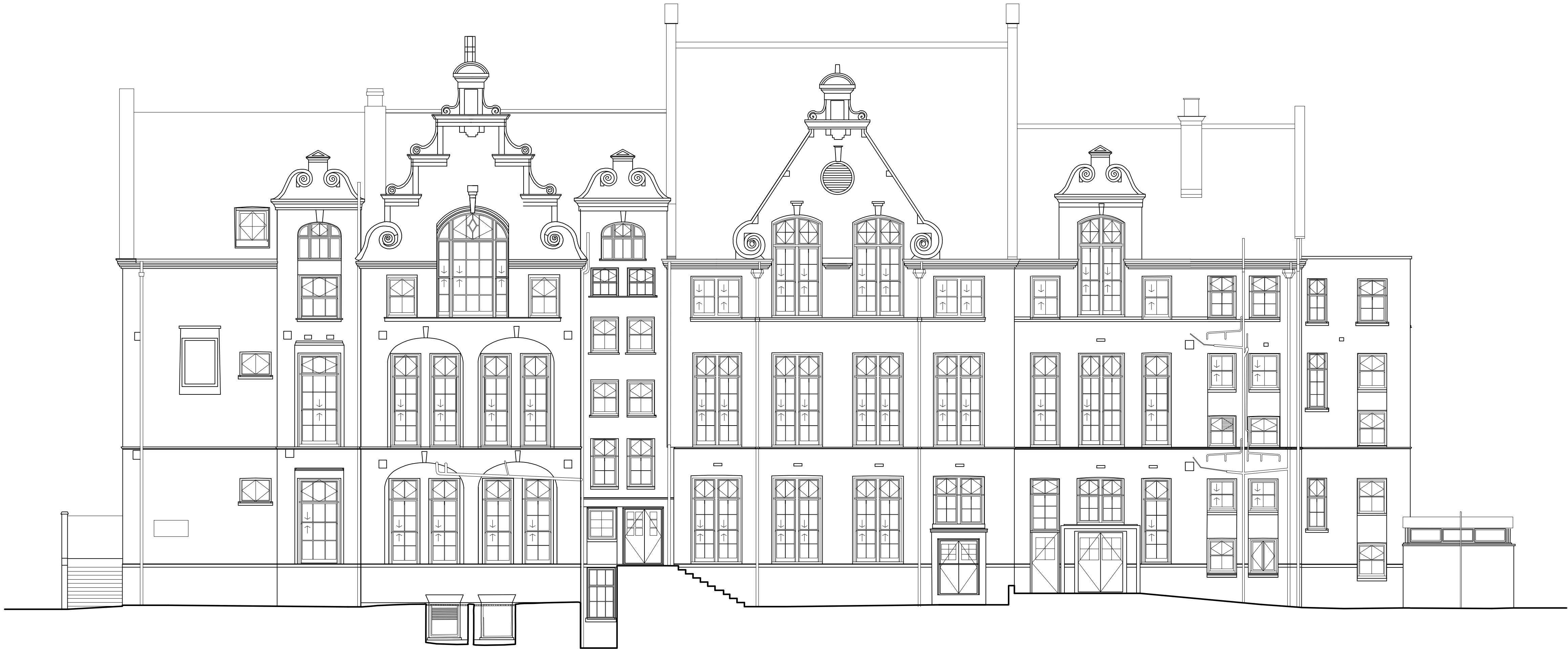
North West Elevation (Princess Street)