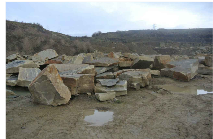
Images above - from Hardscape Sandstone Quarry

Please refer to LUC NBS landscape Specification document - clause D41 for more information.