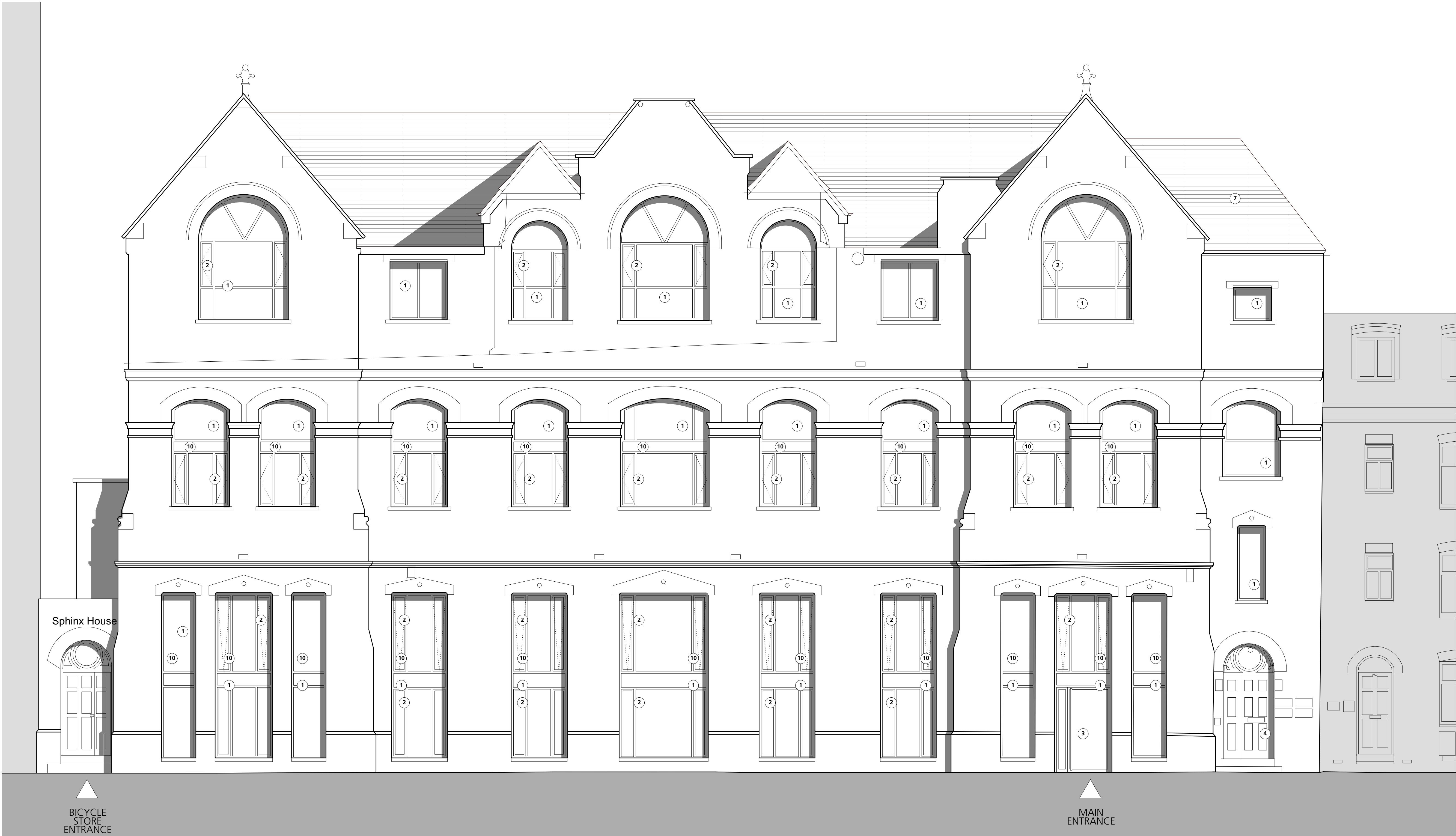
W West Elevation 1:50@A1

GENERAL NOTES. All dimensions to be checked on site prior to commencement of any works, and/or preparation of any shop drawings. Sizes of and dimensions to any structural elements are indicative only. See structural engineers drawings for actual sizes / dimensions. Sizes of and dimensions to any service elements are indicative only. See service engineers drawings for actual sizes and dimensions. This drawing to be read in conjunction with all other Architect's drawings, specifications and other Consultants' information. All proprietary systems shown on this drawing are to be installed strictly in accordance with the Manufacturers/Suppliers recommended details. Any discrepancies between information shown on this drawing and any other contract information or manufacturers/suppliers recommendations is to be brought to the attention of the Architect DO NOT SCALE FROM THIS DRAWING. NOTES.