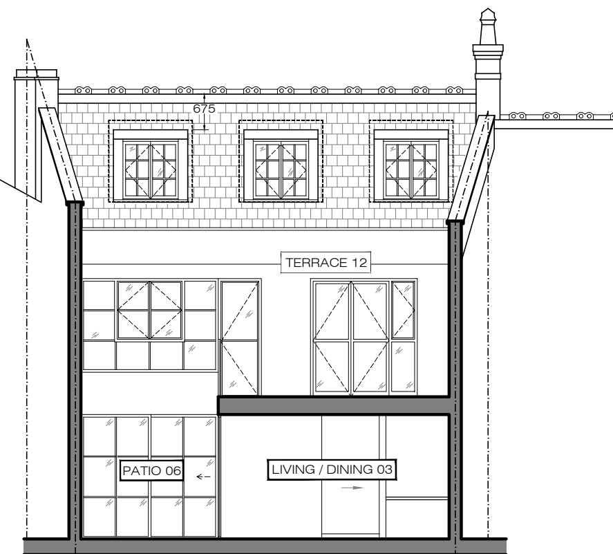
PROPOSED Section BB SCALE 1:100@A3 PA-02