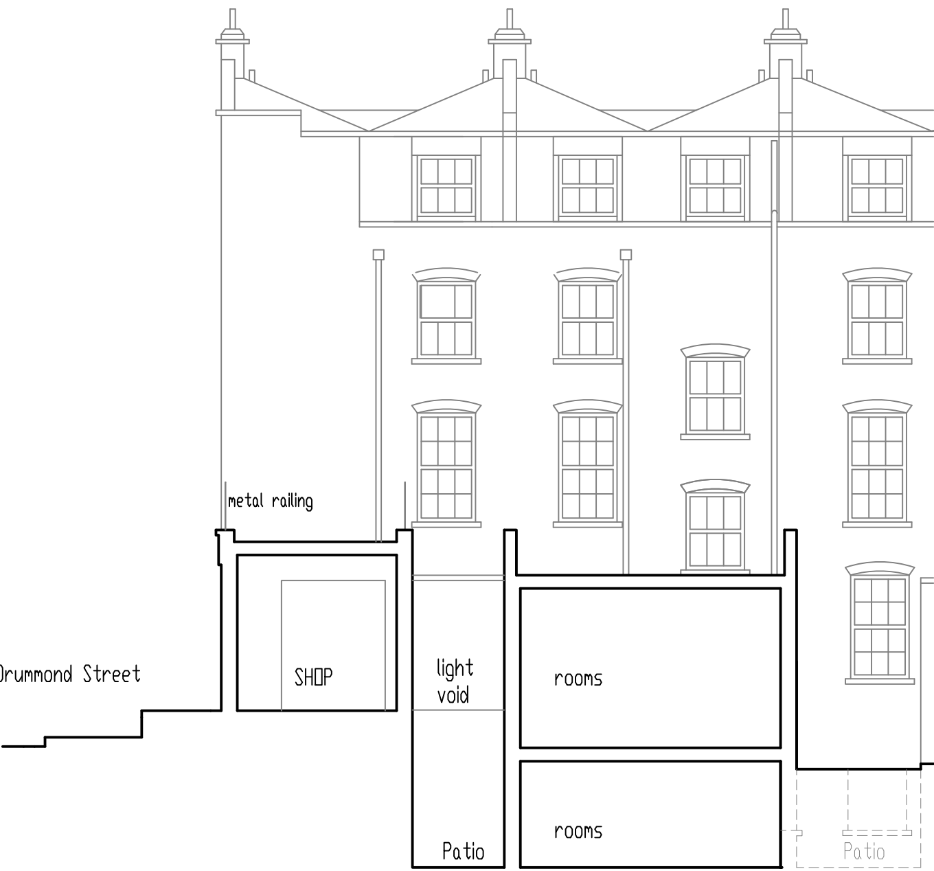
EXISTING REAR ELEVATION / SECTION