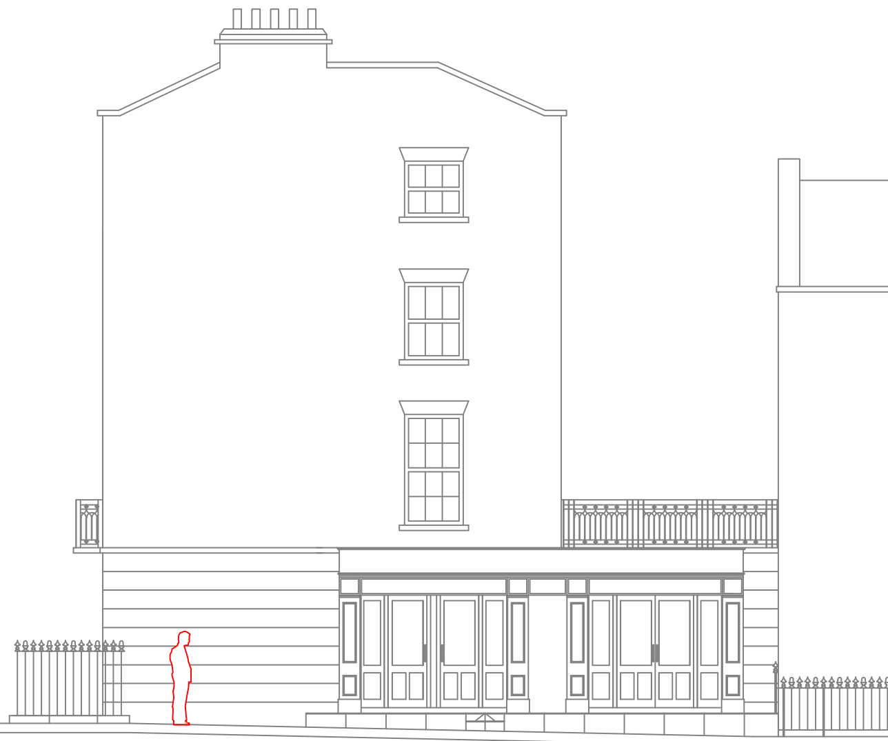
EXISTING DRUMMOND STREET ELEVATION