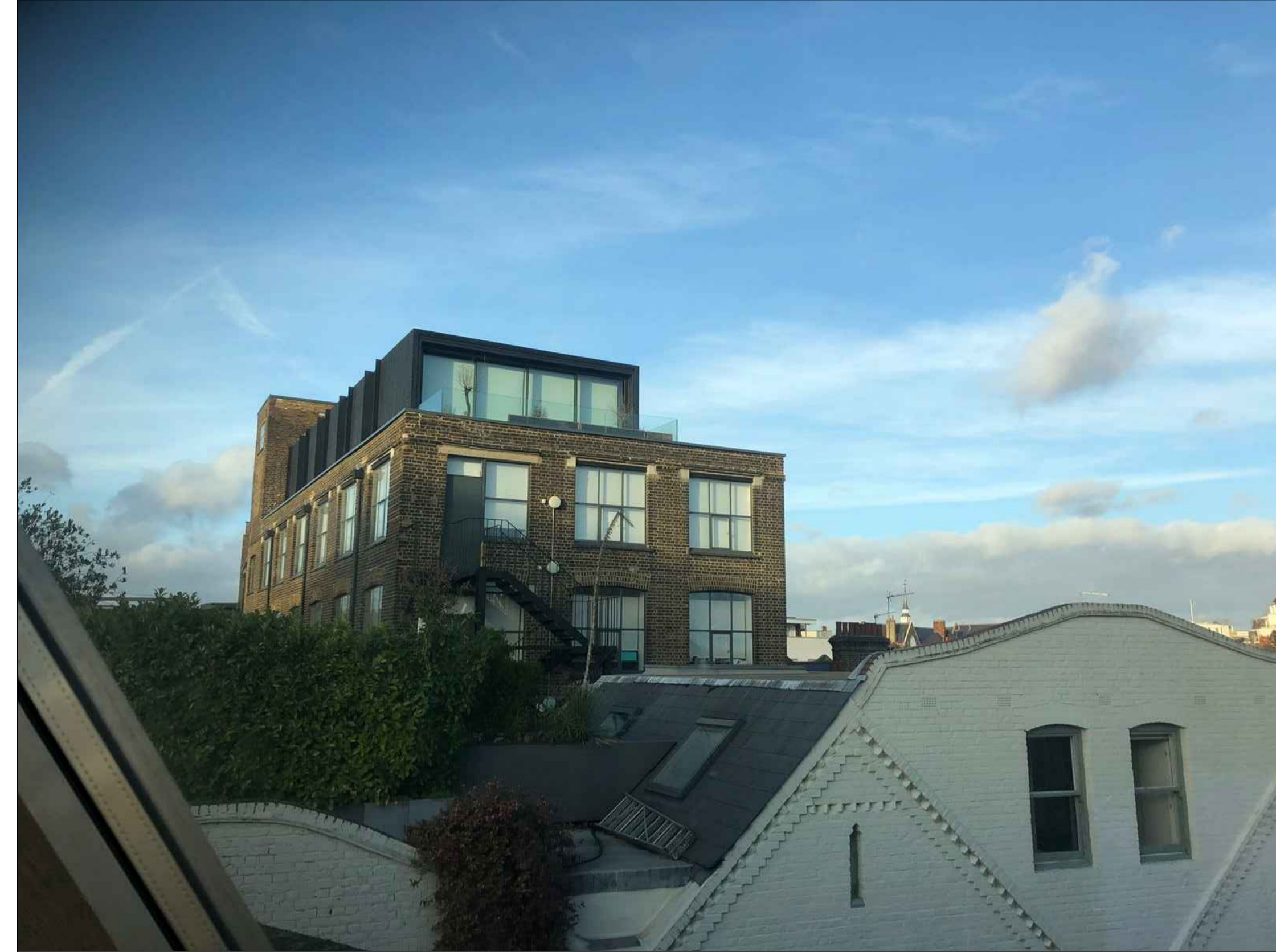
Existing balcony of Imperial works Offices overlooking all properties in Perren Street, as viewed from 1b Perren Street