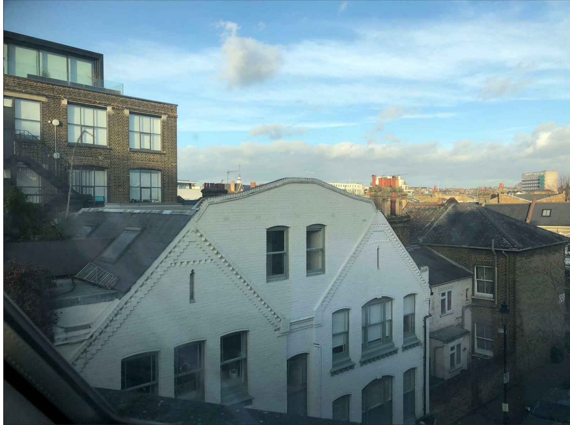
View from existing window looking at No1 Perren Street

Note This drawing is not to be scaled. Use figured dimensions only. All dimensions are to be checked on site and any discrepancies, errors or omissions are to be reported to the architect prior to commencement of works.