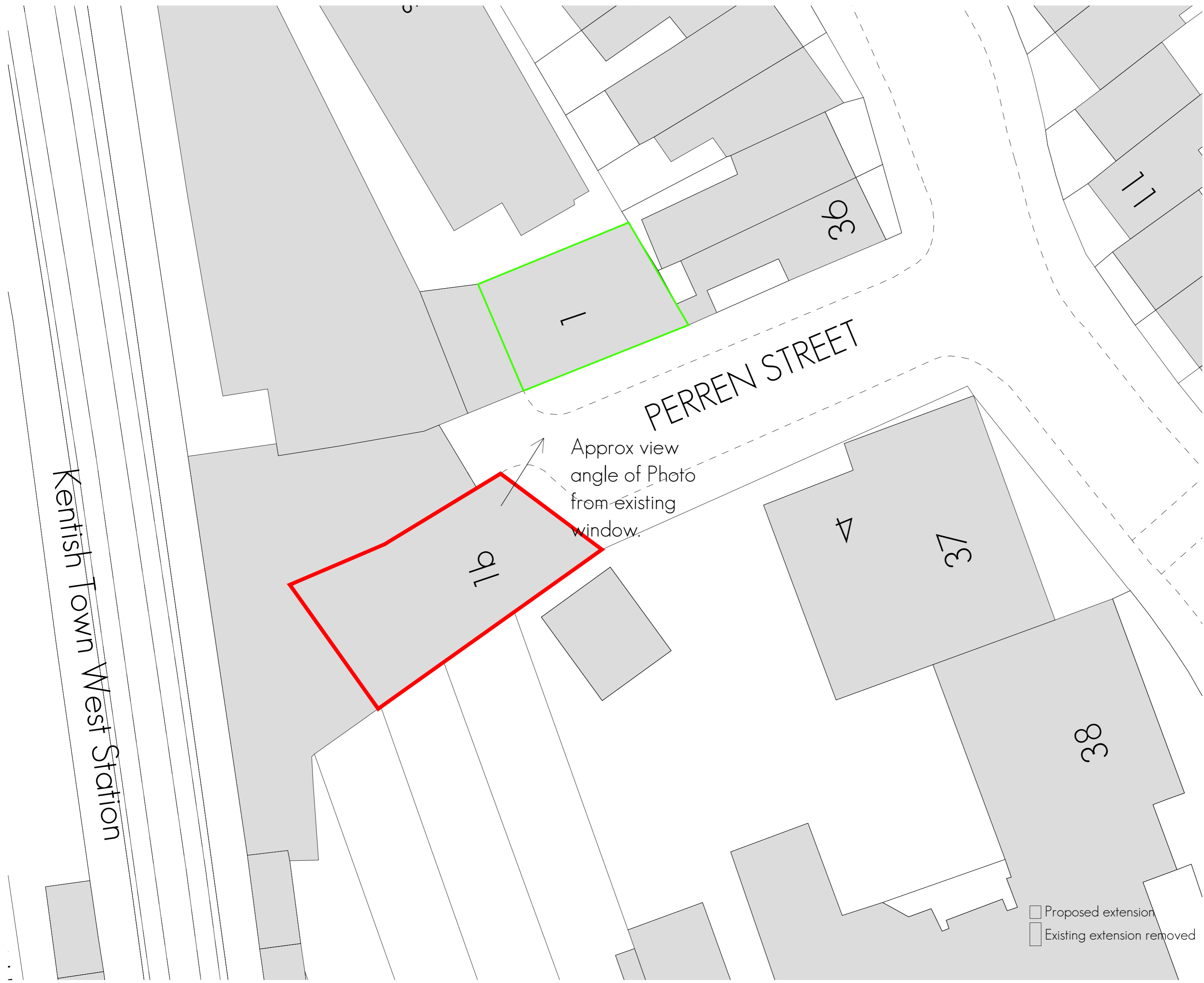
Block Plan 1:200