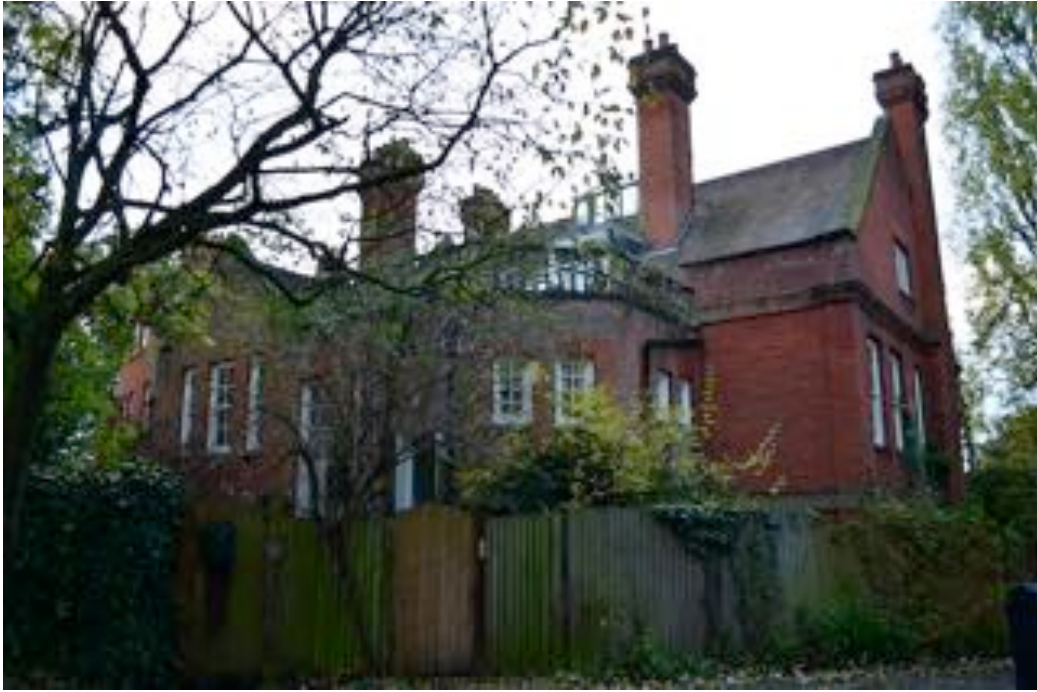
Upper Wellside from Well Walk