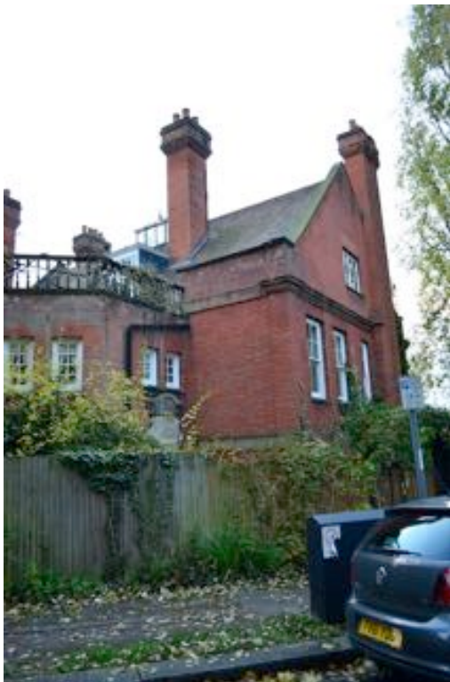
Upper Wellside from Well Walk