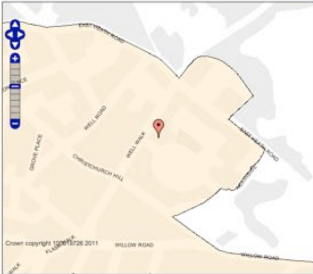
Hampstead Conservation Area Map

Upper Wellside is located in the Hampstead Conservation Area, as shown in the map below.