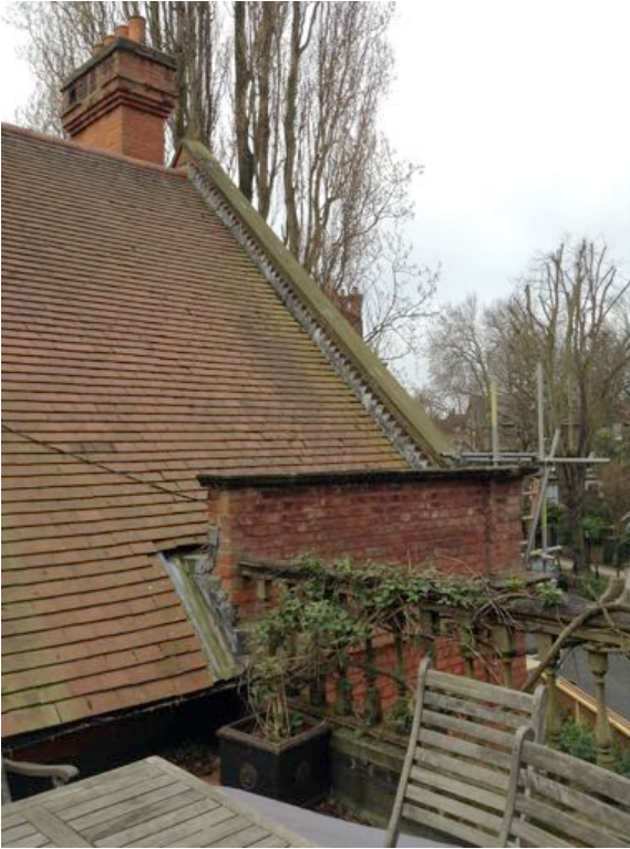
Existing Roof and Parapet