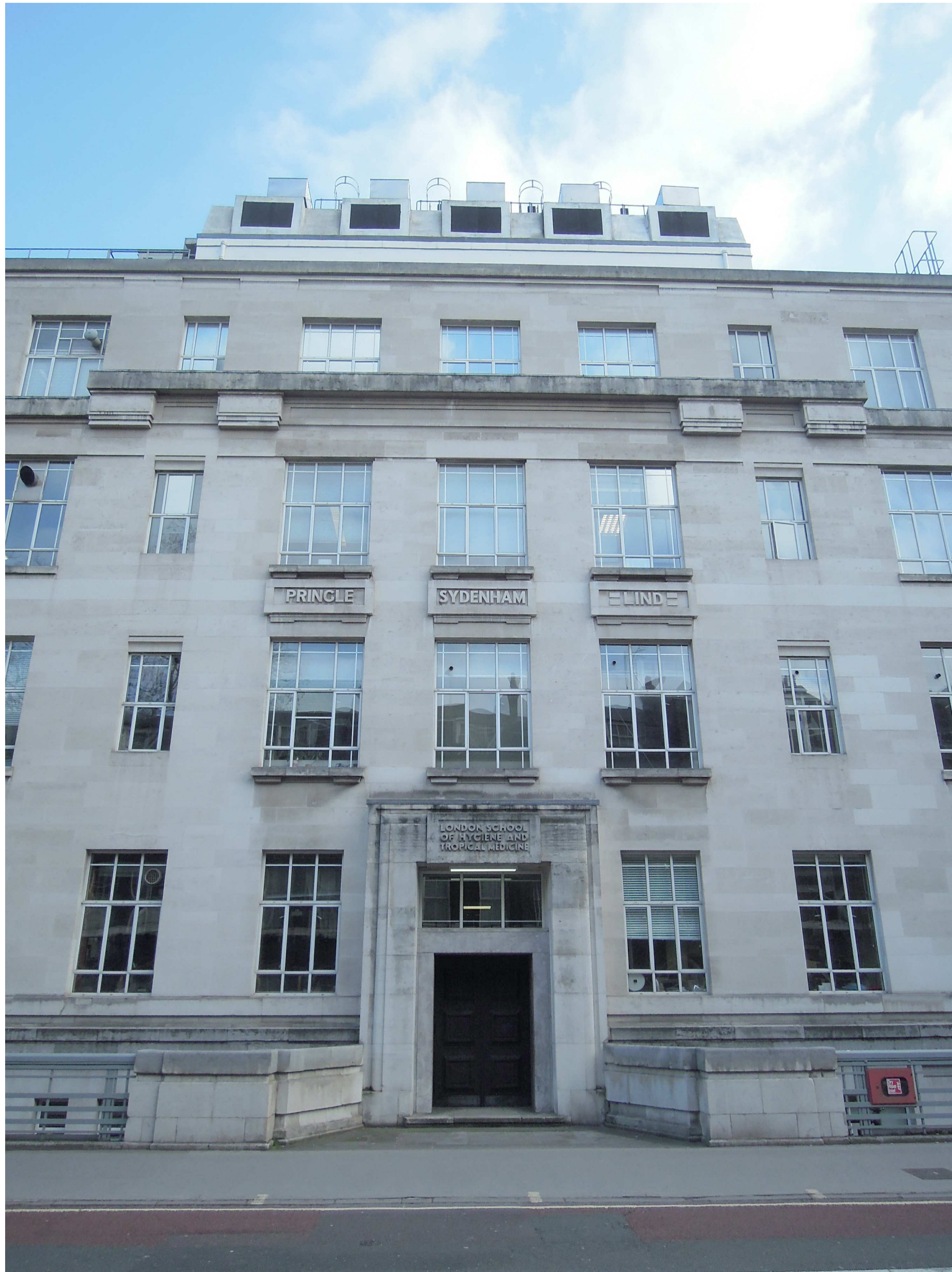
Gower Street Elevation in Existing Condition