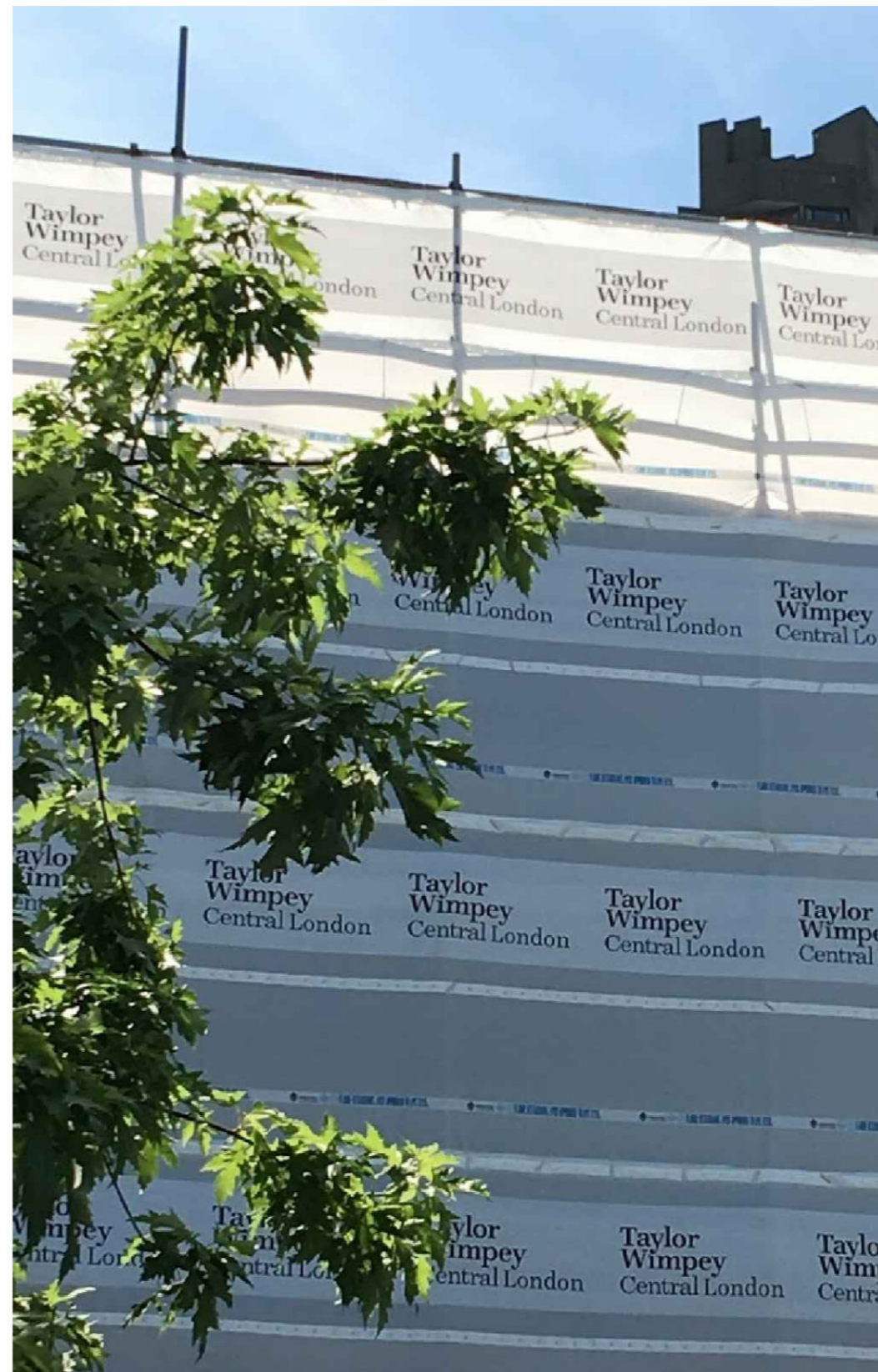
02 Signage Example Scale n/a