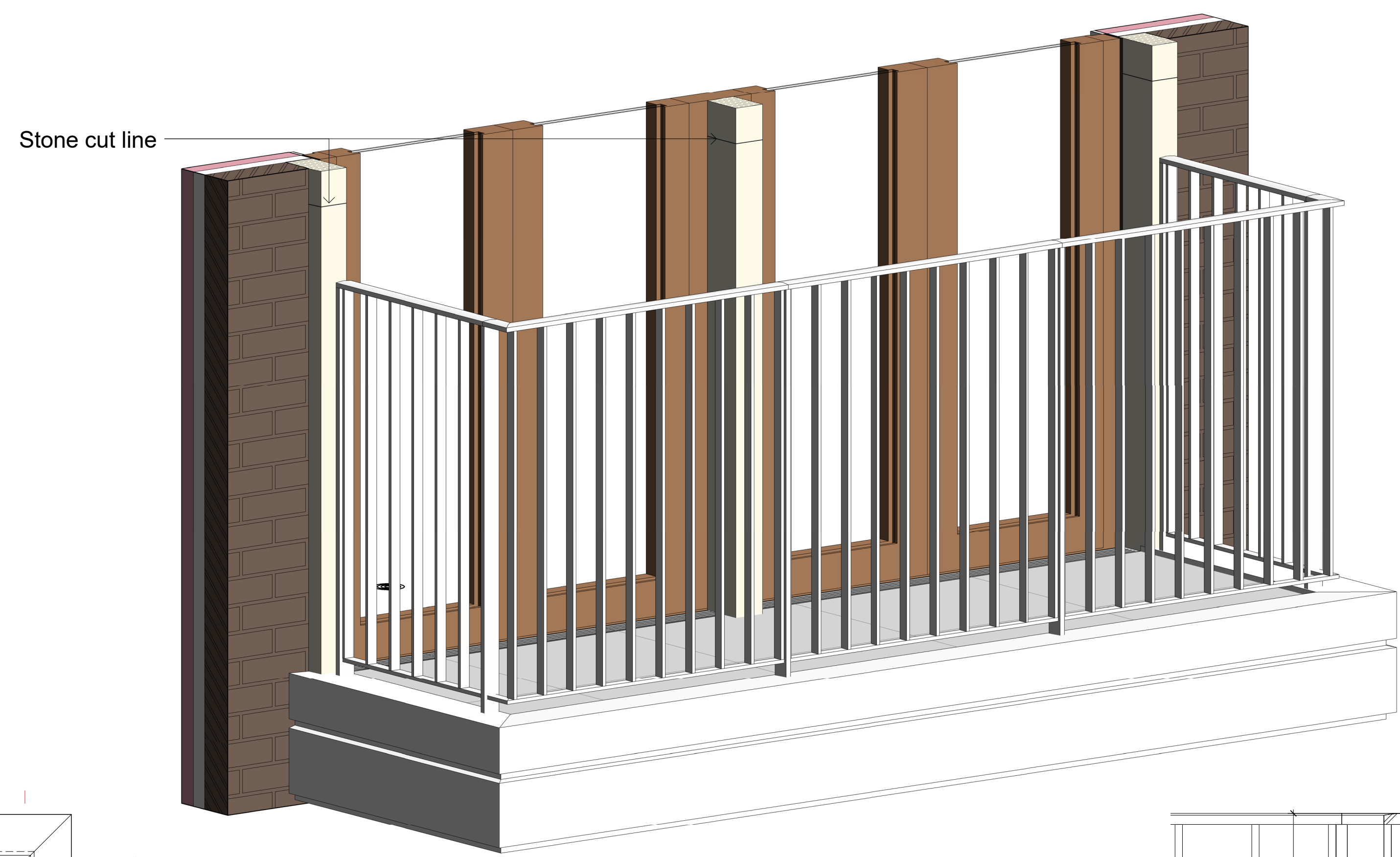
3 Railing view