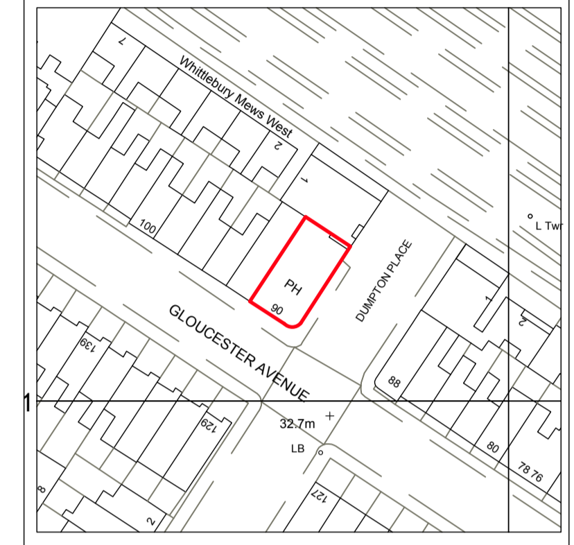
SITE PLAN - 1:1000 @ A1

DRAWING ILLUSTRATES DESIGN INTENT ONLY. CONTRACTOR TO PRODUCE SHOP DRAWINGS FOR DESIGNER APPROVAL IF REQUIRED. CONSTRUCTION ISSUE DRAWINGS MUST BE CONTRACTOR'S OWN.