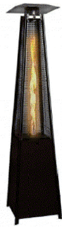
2NOS GAS PATIO HEATERS - BLACK FINISH