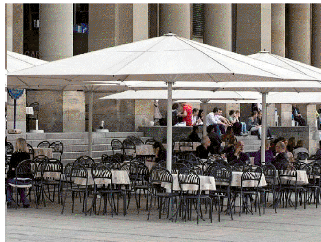
1NOS OUTDOOR PARASOL 3000 x 3000