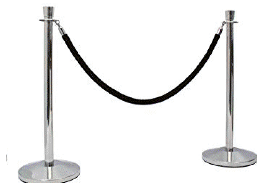
2NOS SETS OF POLE & ROPE BARRIERS