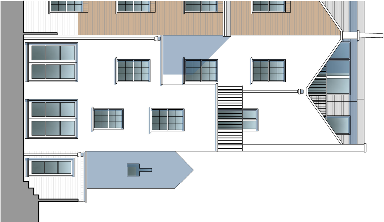
Proposed rear elevation Scale 1:100 @A3