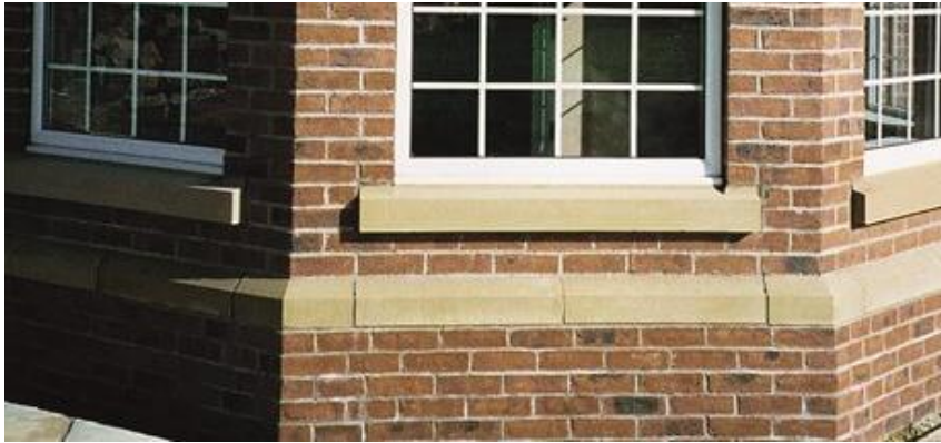
Image of specified cast stone stooped cill as specified