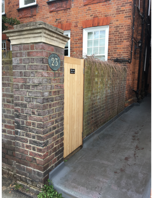
Photo showing gate to No. 23 (right) in context of neighbour gate to No. 23a