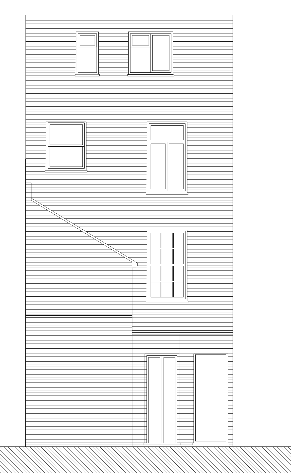
Existing Rear Elevation - 1:50 @A1

Proposed Side Elevation / Section - 1:50 @A1