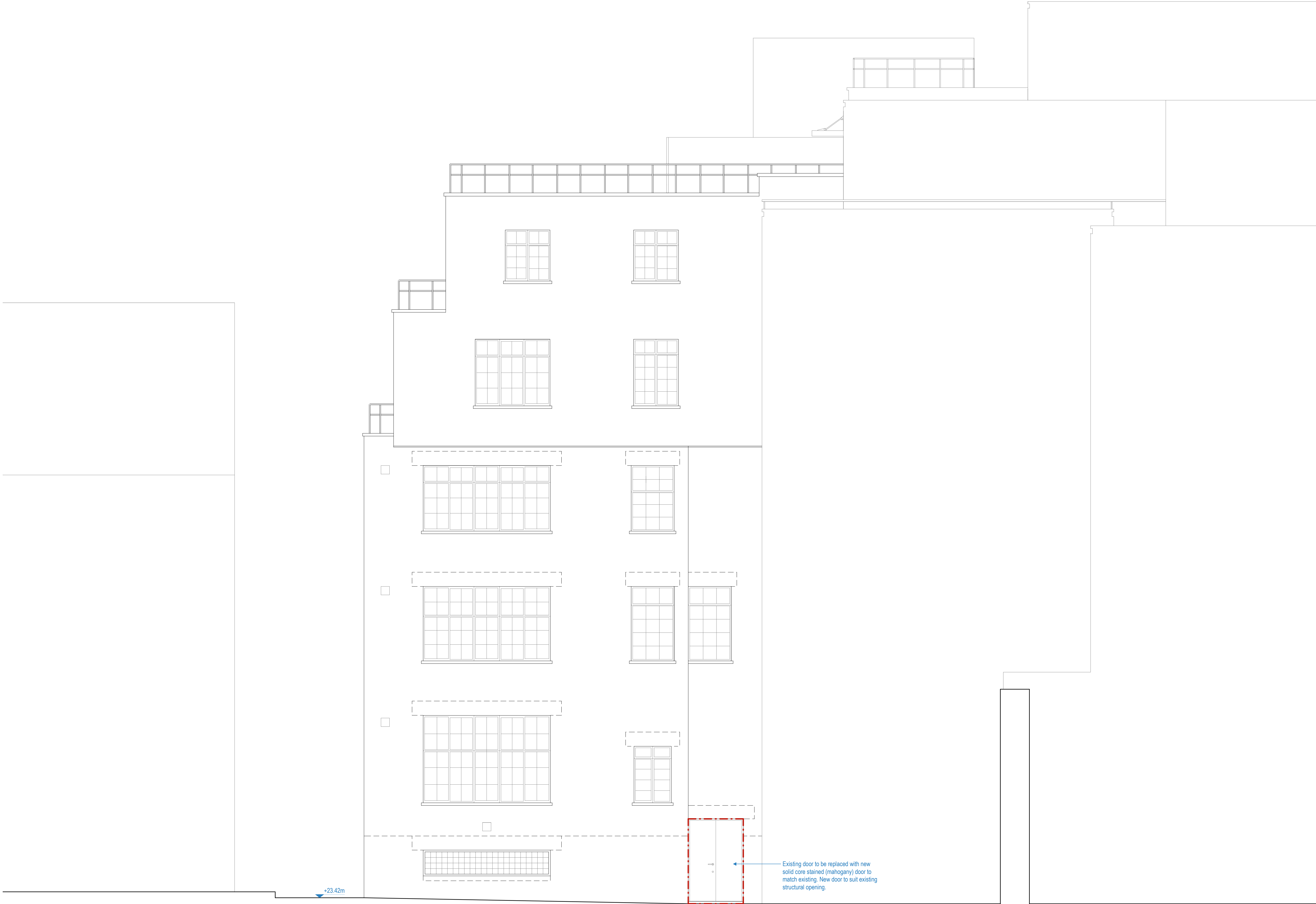
BARCLAY HOUSE COURTYARD