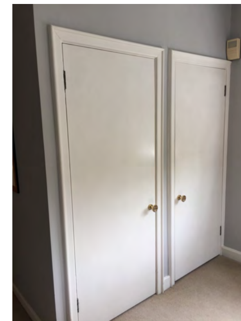
Existing Storage Rooms

Notes: Do Not Scale Check all dimensions on site © Dunthorne Parker Architects