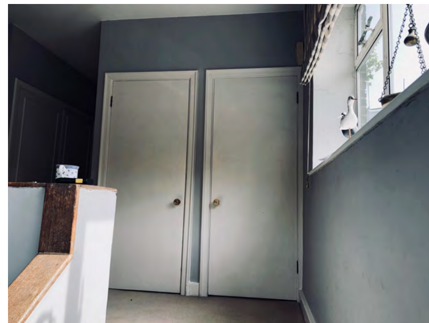
1st Floor Landing Area