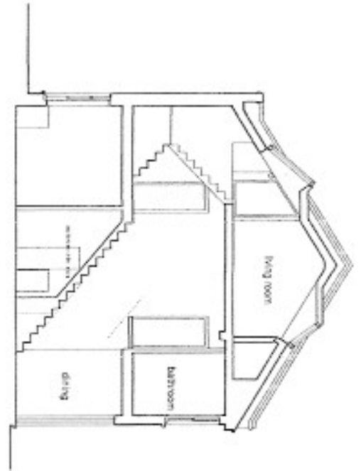
section A-A - as proposed