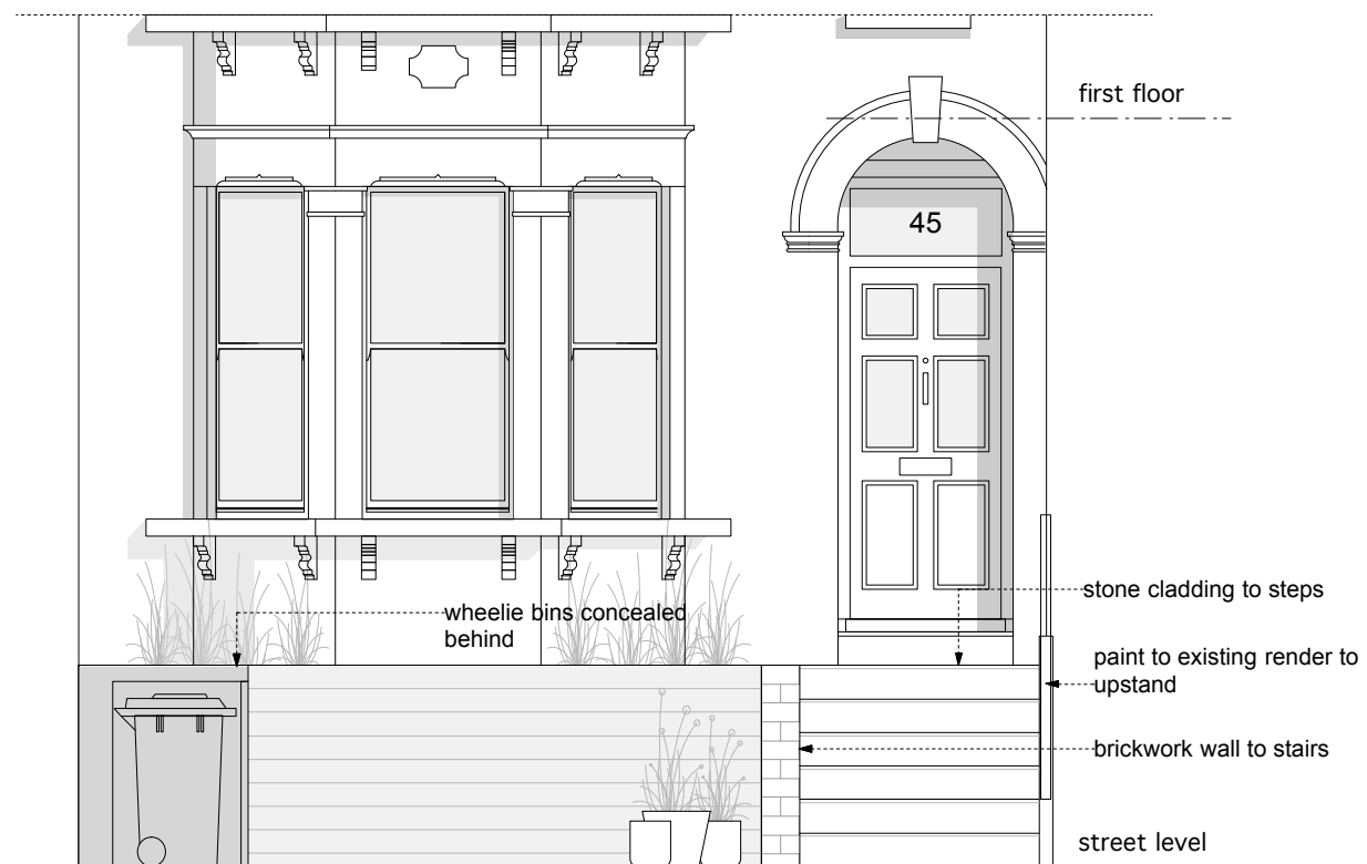
45 Constantine Road Front Garden