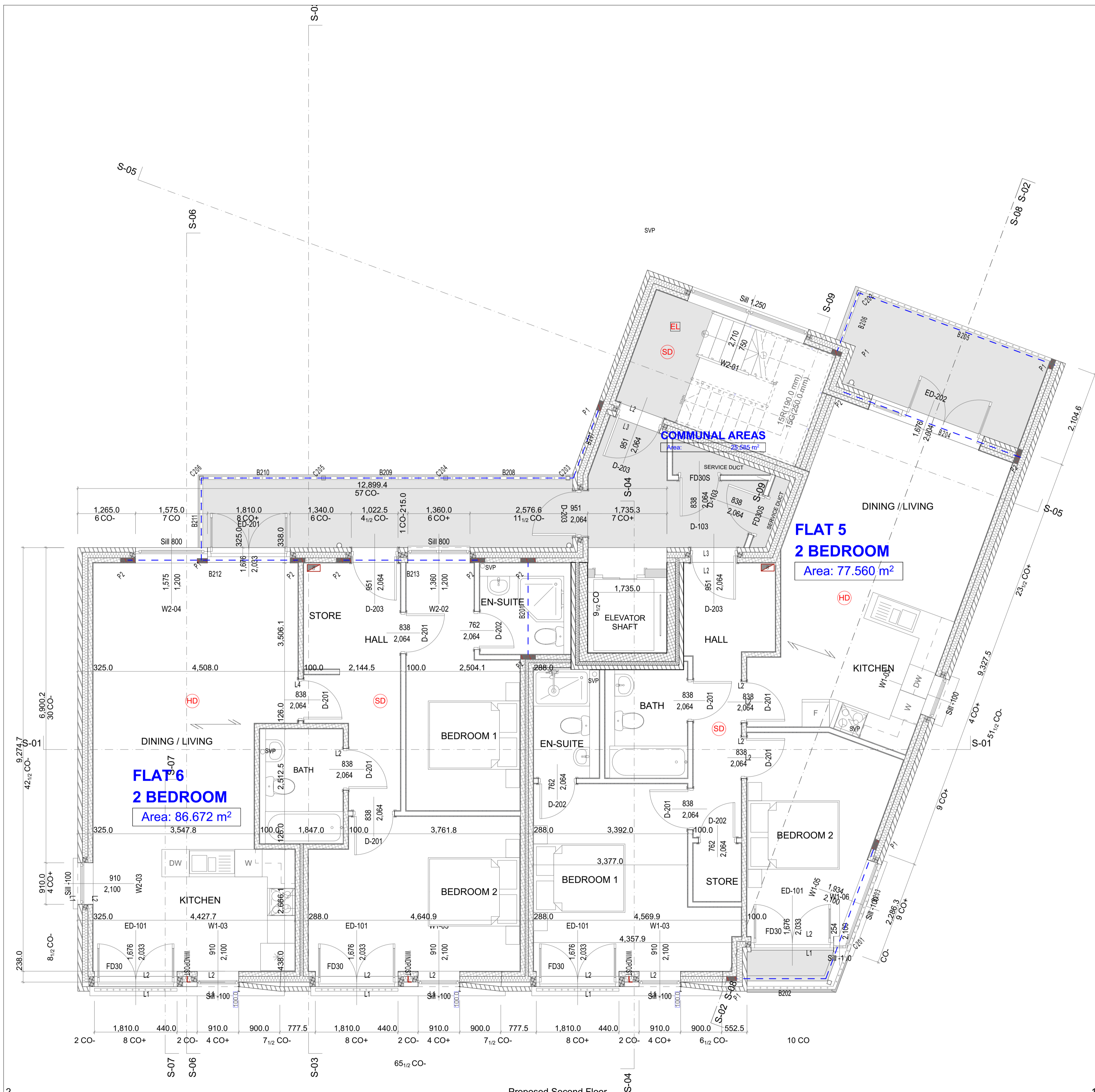
2 Proposed Second Floor 1:50