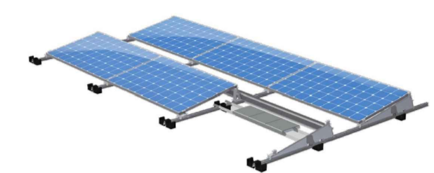
VAN DER VALK SOUTH FACING BALLAST

21NO. 360W LG MODULES MOUNTED TO A 10 DEGREE VDV BALLAST SYSTEM. INVERTER LOCATION WITHIN SOUTH PLANT ROOM BELOW