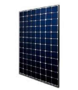
LG - 360W