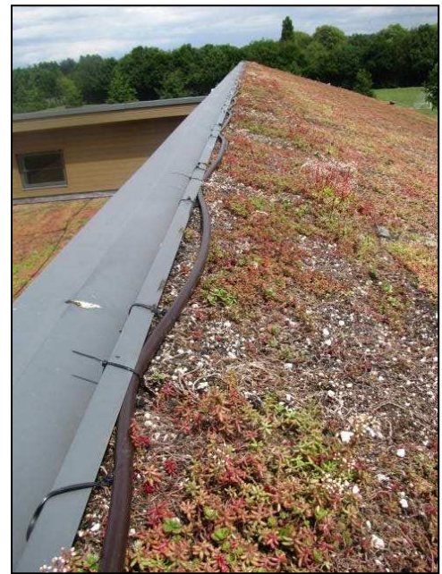
Sedum blanket being applied to a steep sloped roof, fitted with both retention strips and drip line irrigation.

The benefit of applying a shallow build-up on steeper slopes can also have a consequence in respect of water retention capacity and therefore provision for artificial irrigation should be allowed for under certain conditions. These are outlined below: -