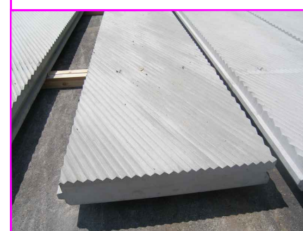
Ref: 2 - Precast Concrete Ramp (Light Gray Ridged Finish for Grp)