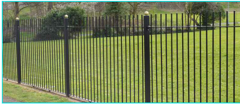
Ref: 9 - Ironmongery fence full height (Jet Black Gloss Coat Finish)