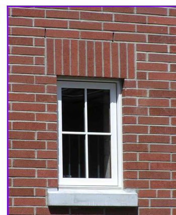
Ref: 5 - Soldier Course (Brickslip Finish Britannia Range Deep Sanded Red)