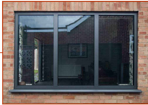
Ref: 8 - Aluminum framed windows (Dark Grey Powder-Coated Finish)