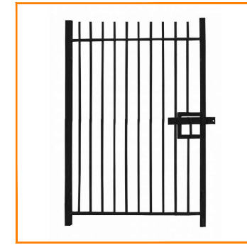
Ref: 10 - New secure & lockable ironmongery entrance gate