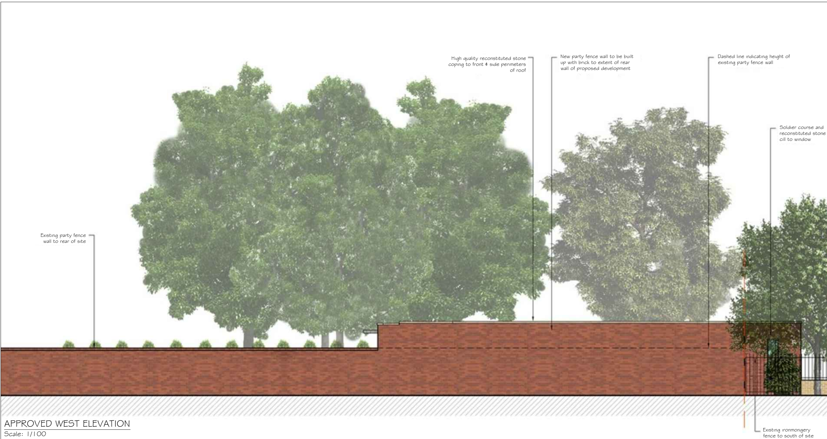
APPROVED WEST ELEVATION Scale: 1/100