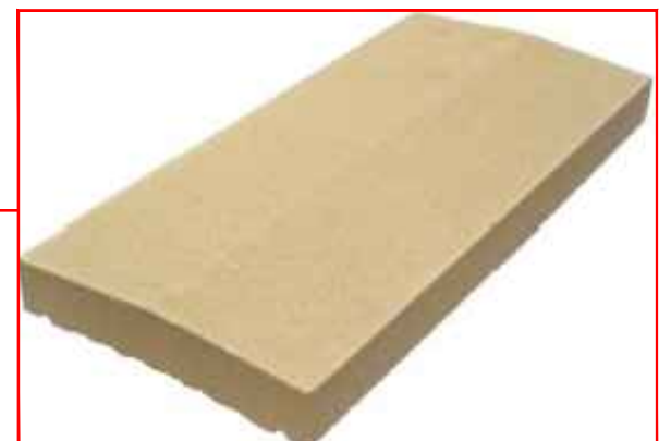
Ref: 6 - Flat Coping Stone (Sand Stone Finish)