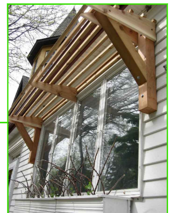
Ref: 4 - Timber Slat Canopy (Timber Finish & Coated with protection. Colour: T.B.C)