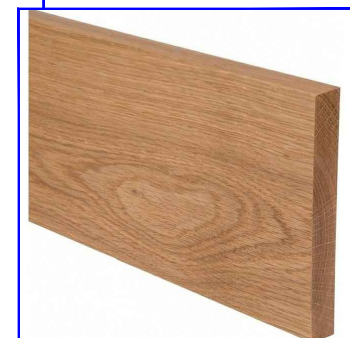
Ref: 1 - Solid Plinth (Timber Finish Oak)