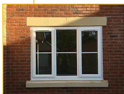
Ref: 3 - Reconstituted stone cill (Sand Stone Finish)