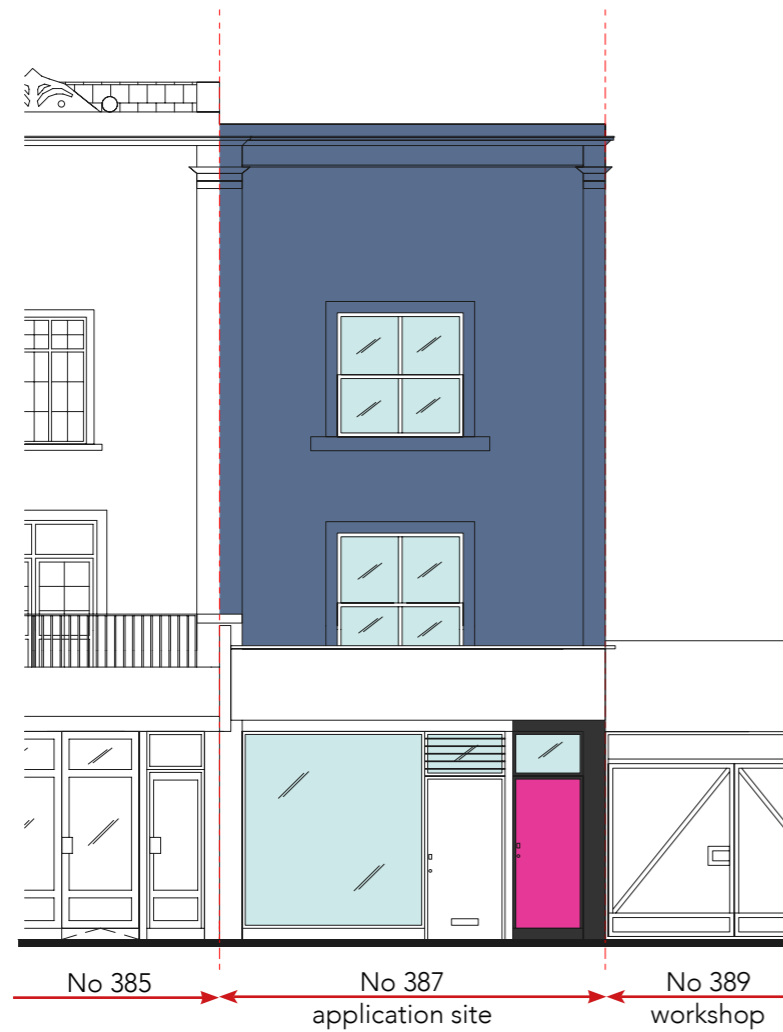
Existing Front Elevation (A)