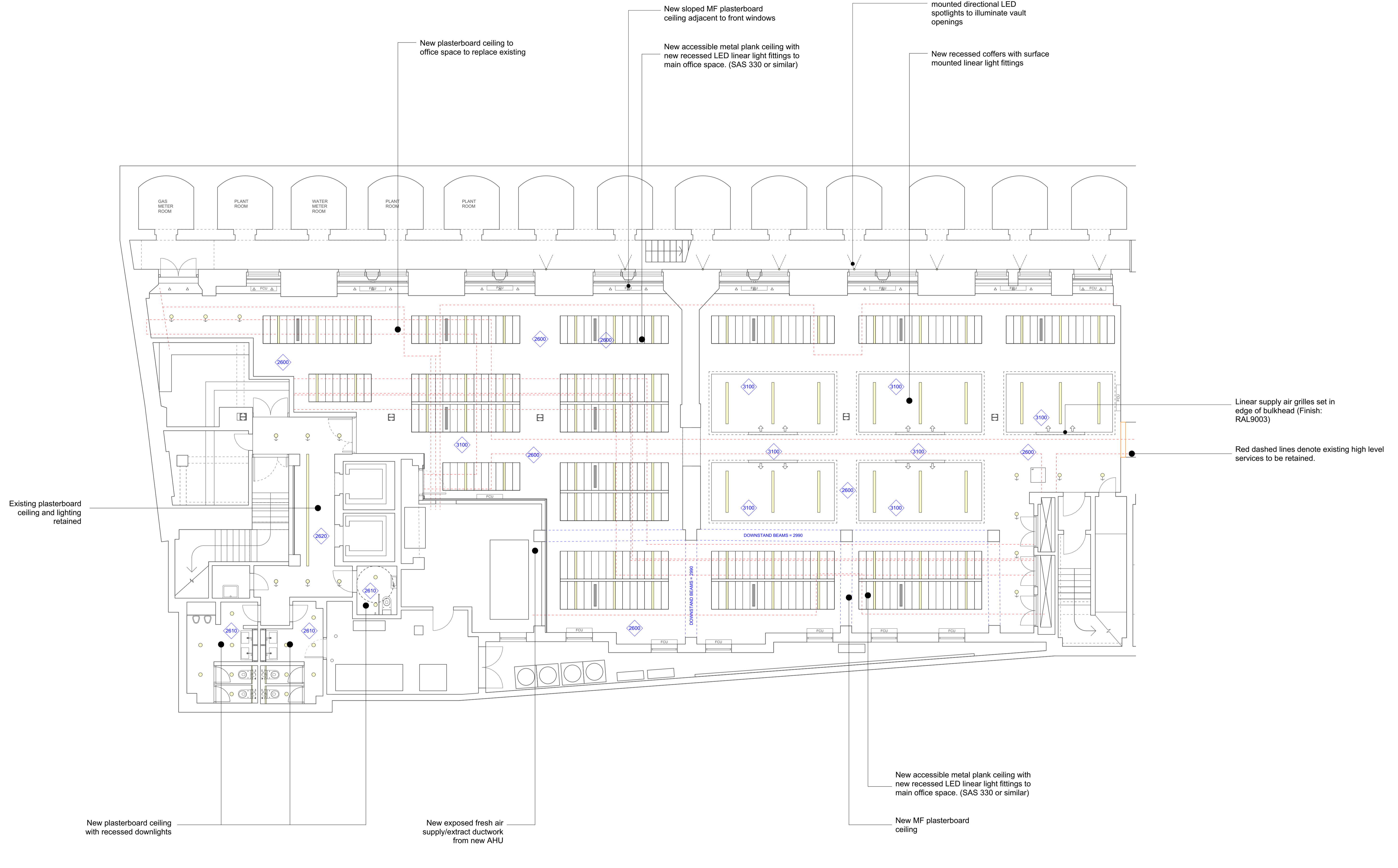
1 Proposed Lower Ground Floor RCP Scale: 1:75