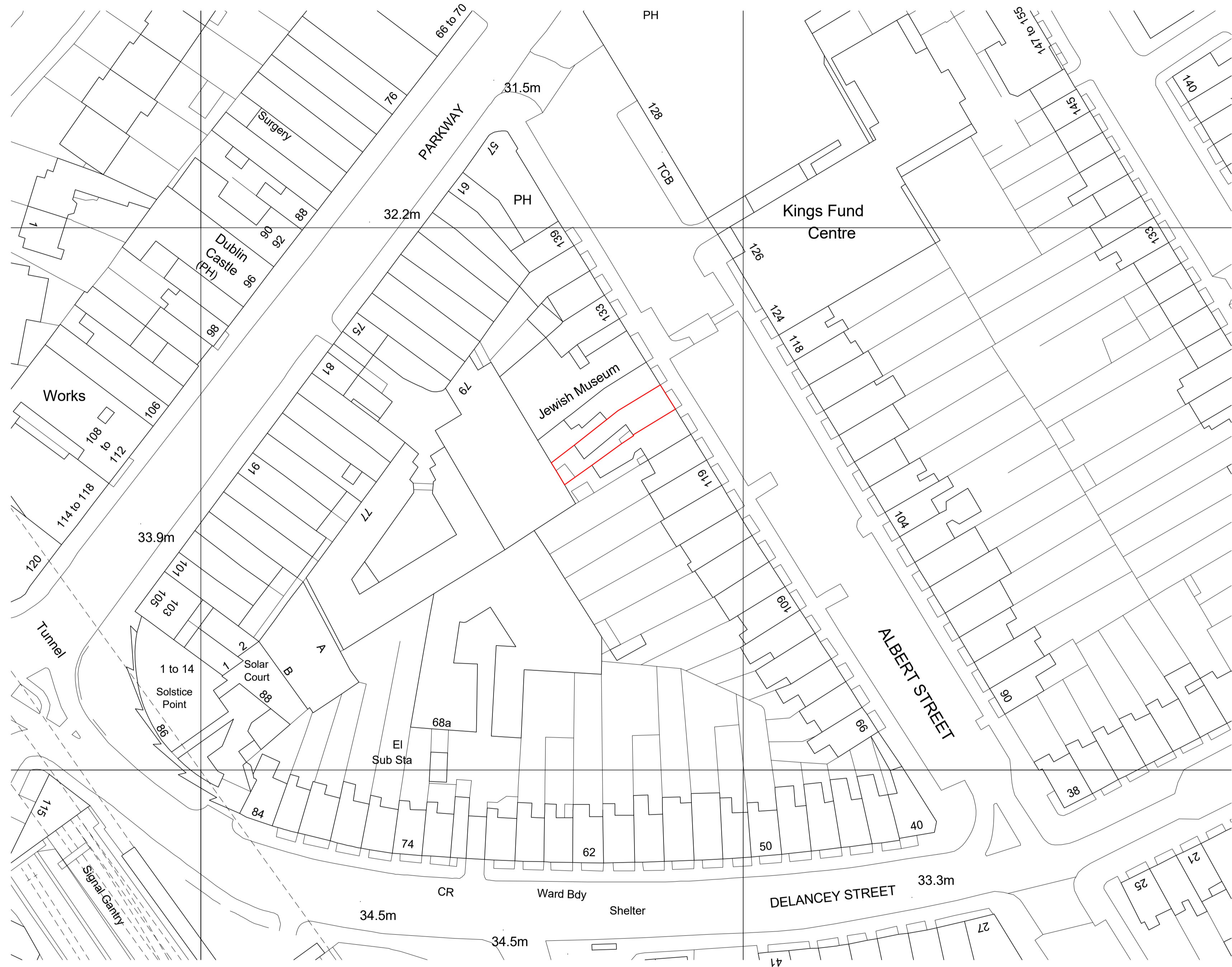
2 Site Plan 1 : 500