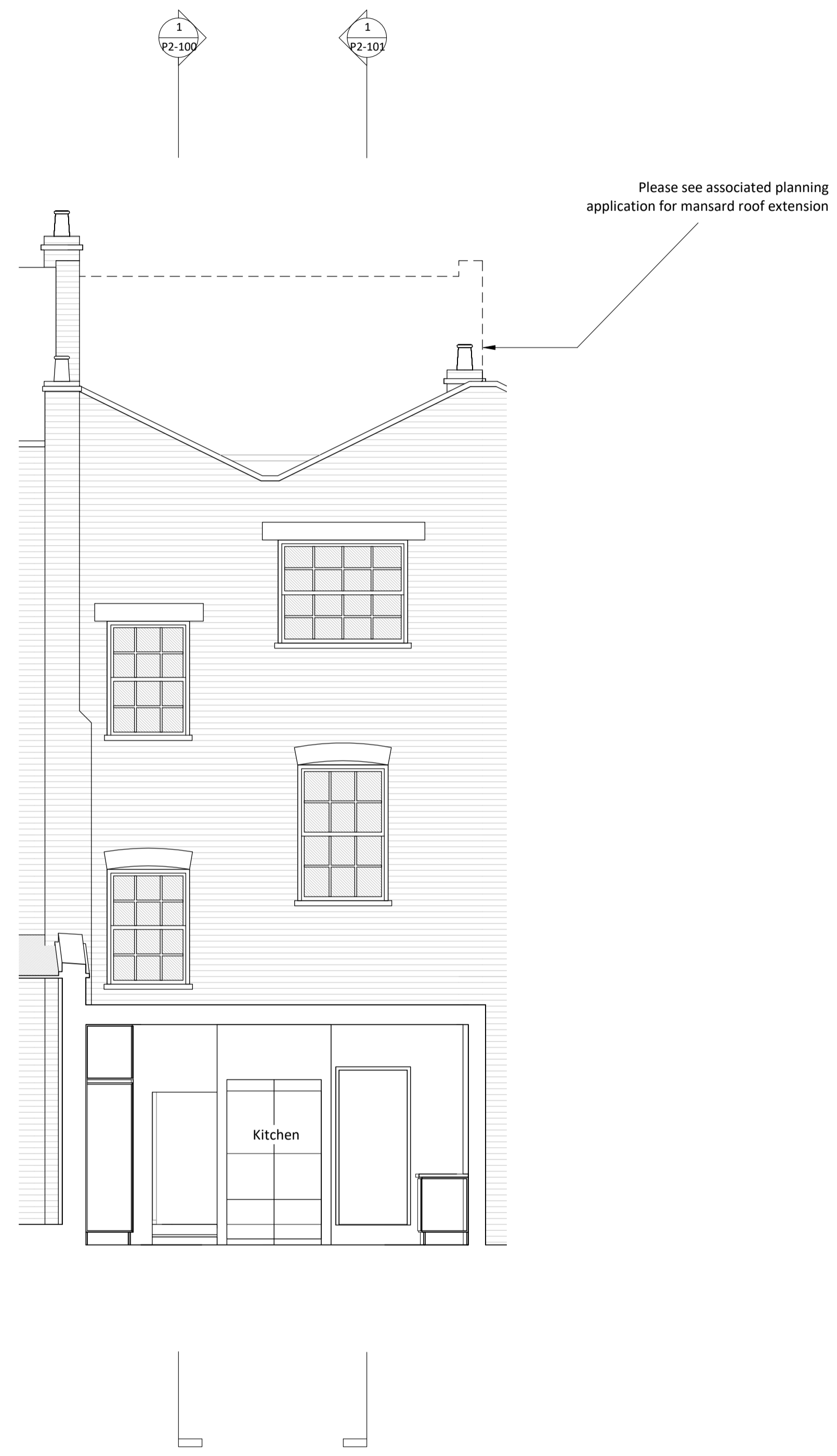
Section 4 1:50