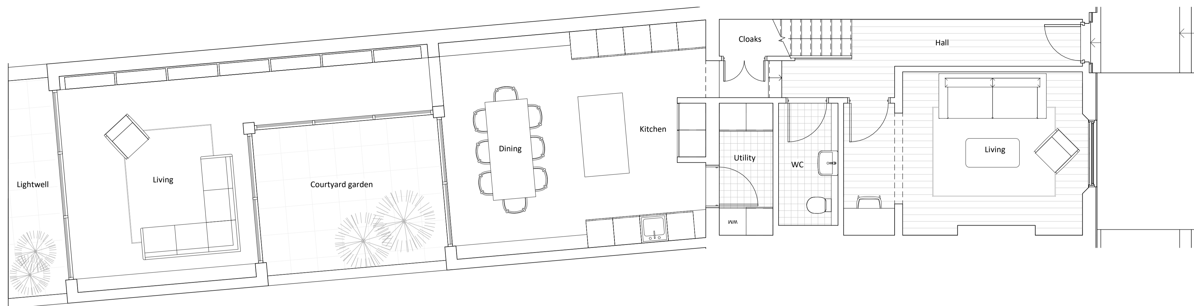
Ground Floor Plan 1:50

NOTES This drawing is not to be used for construction purposes.