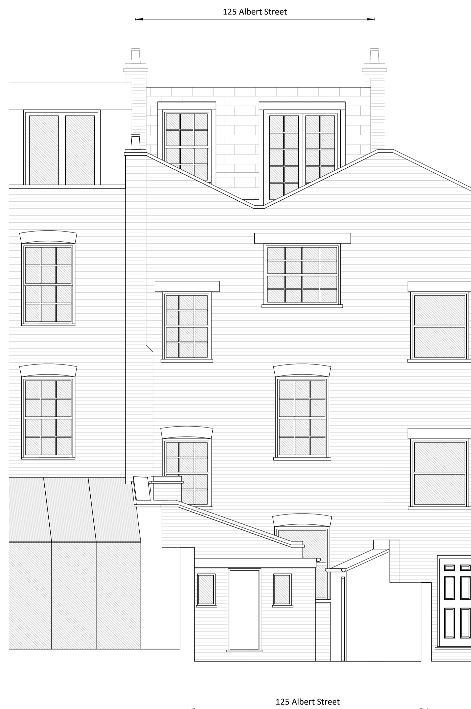
West Elevation 1:50