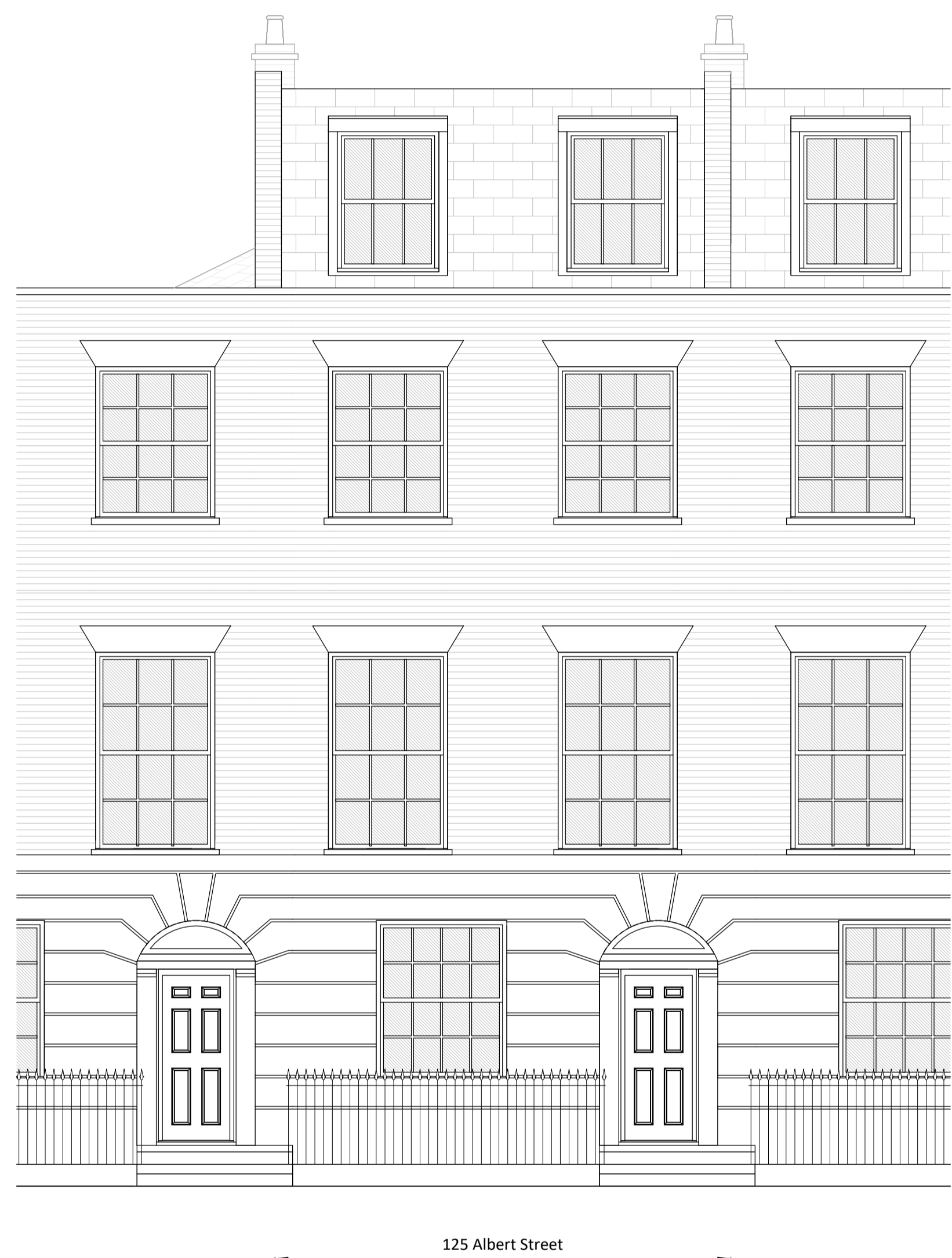
East Elevation 1:50

This drawing is not to be used for construction purposes.