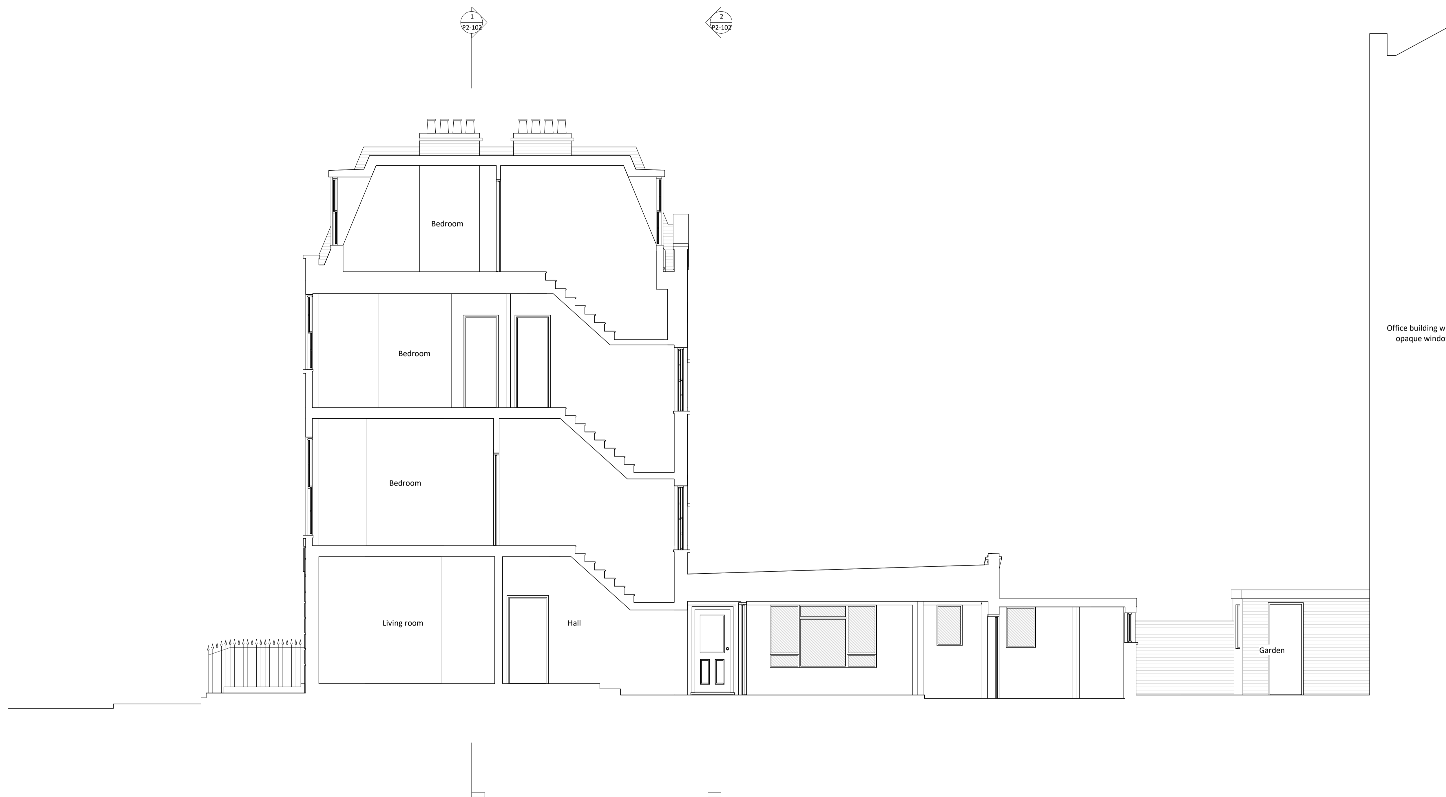
Section 1 1:50

This drawing is not to be used for construction purposes.