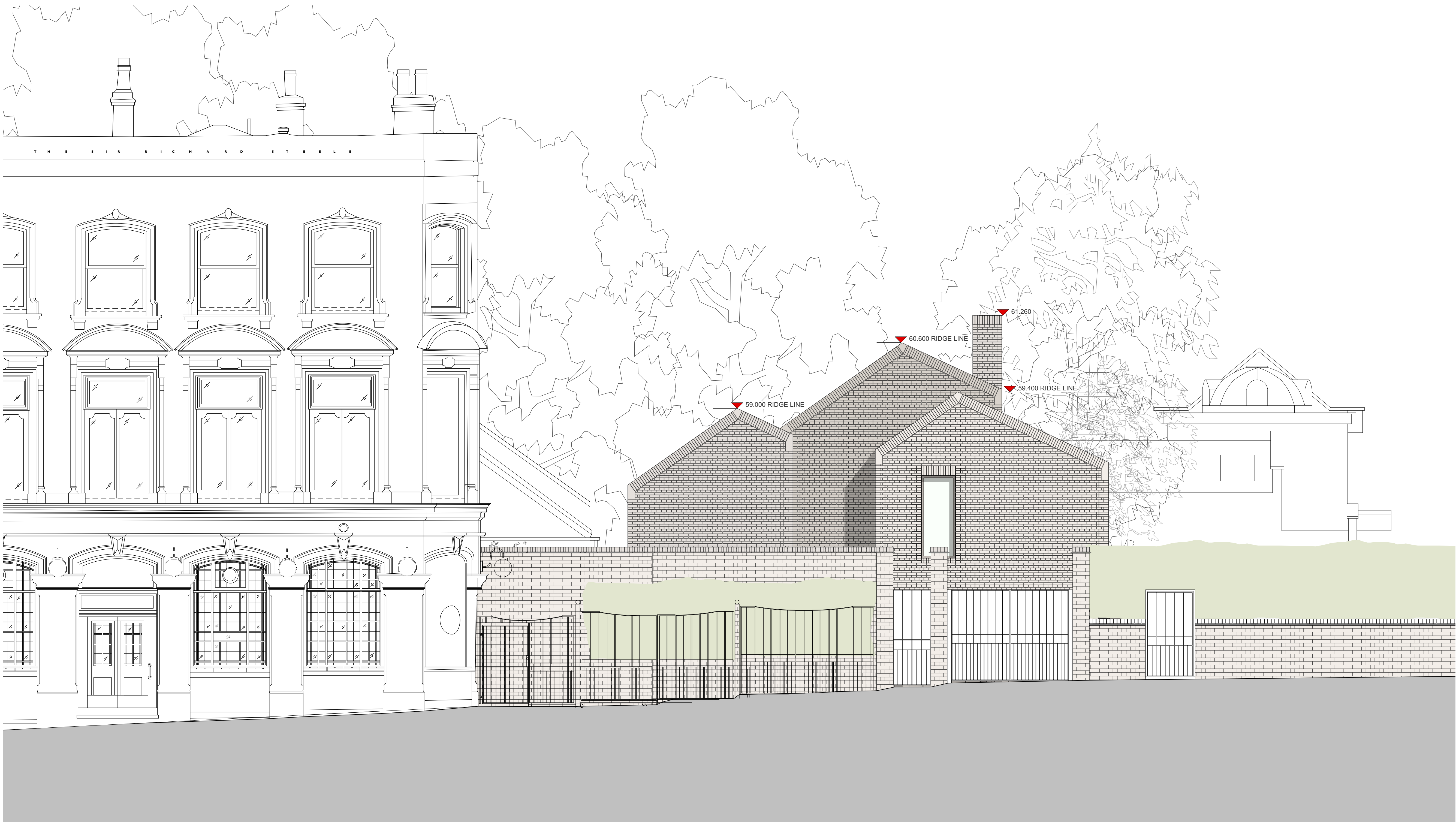
PROPOSED SECTION E-E