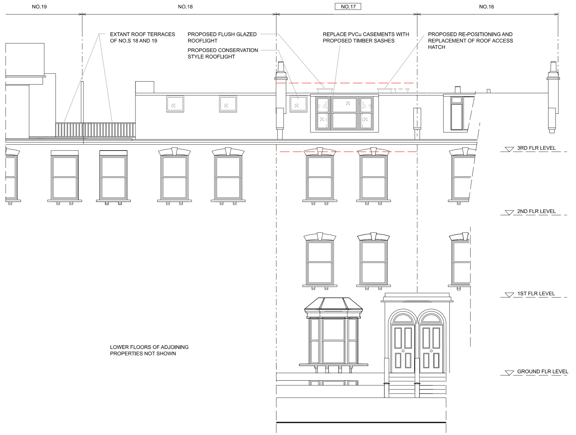
15 A FRONT/ STREET ELEVATION AS PROPOSED