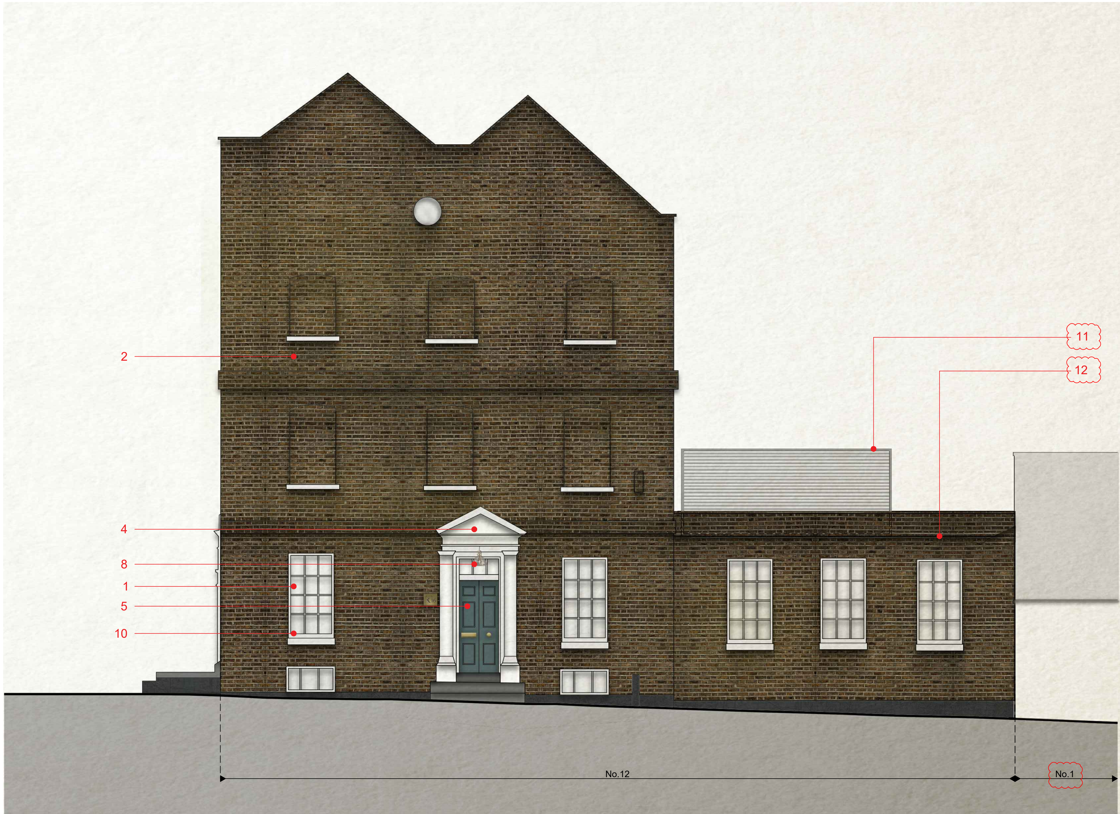
01 Proposed Elevation - Kings Mews