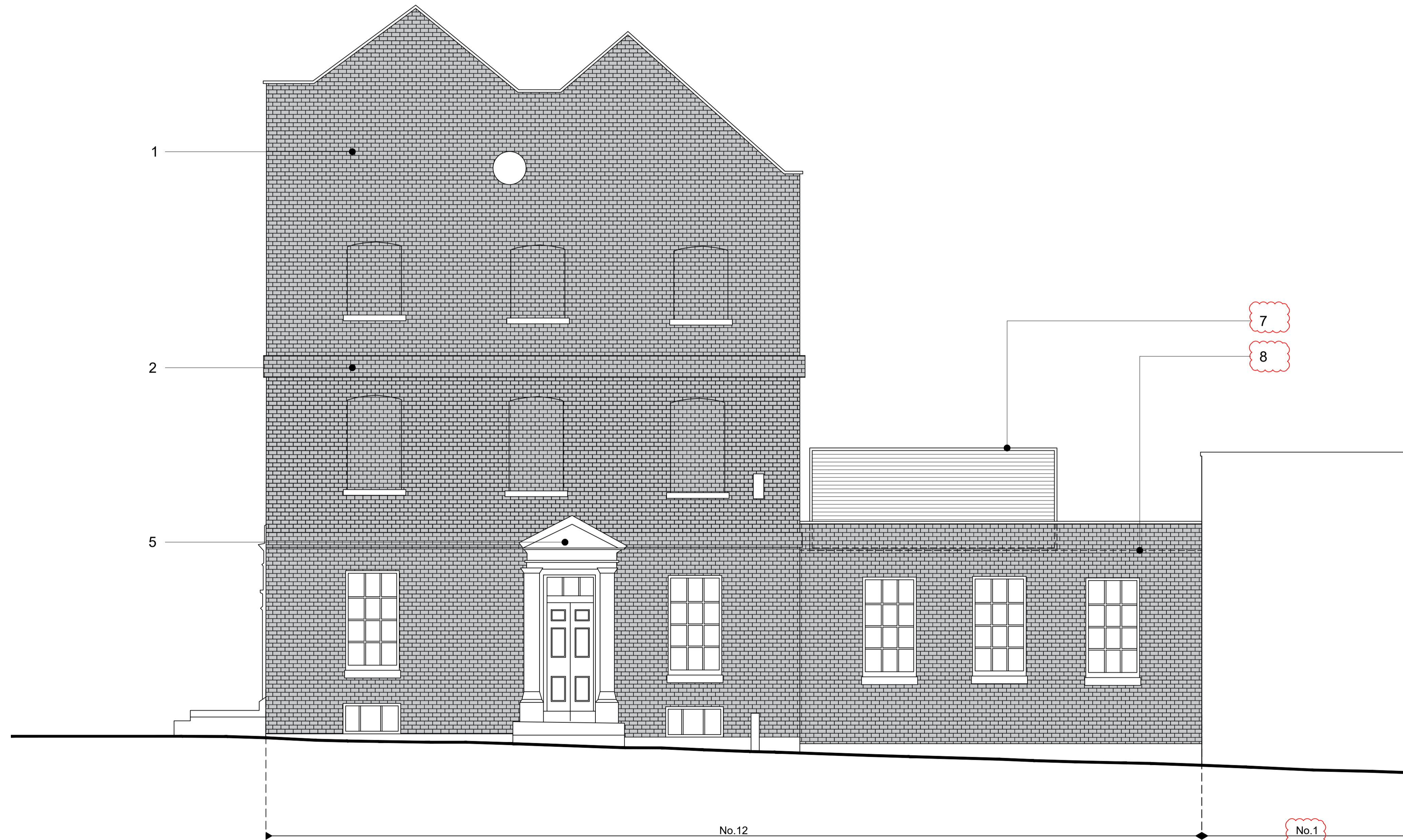
01 Existing Elevation - Kings Mews

Number 017-TWA-XX-XX-DR-AR-07001 Revision A