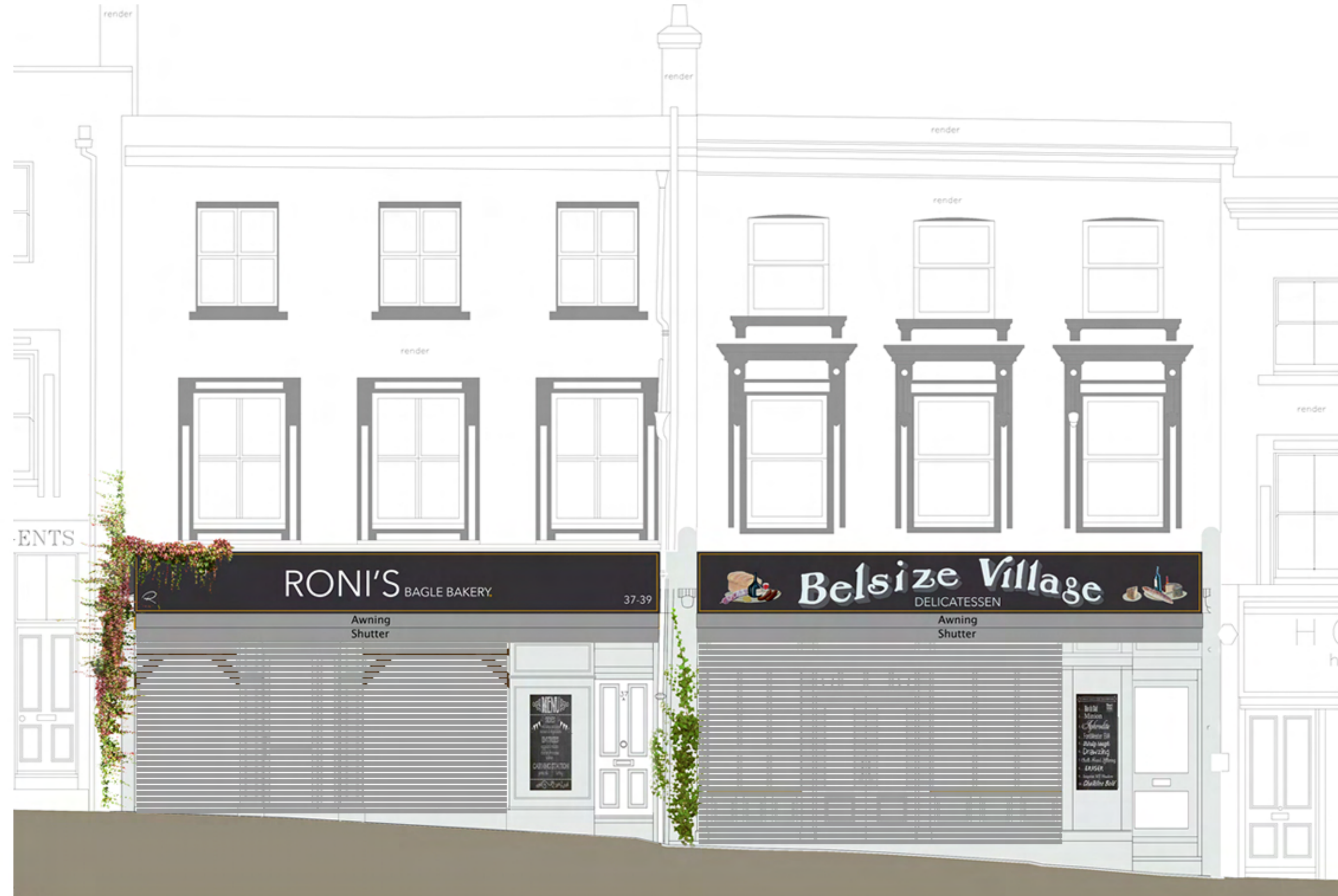
WEST ELEVATION (BELSIZE LANE) A.O.D. 62.00m

THE CO-ORDINATES ARE DERIVED FROM THE ORDNANCE SURVEY ACTIVE STATION NETWORK OSTN15 (BASE STATION ST04)