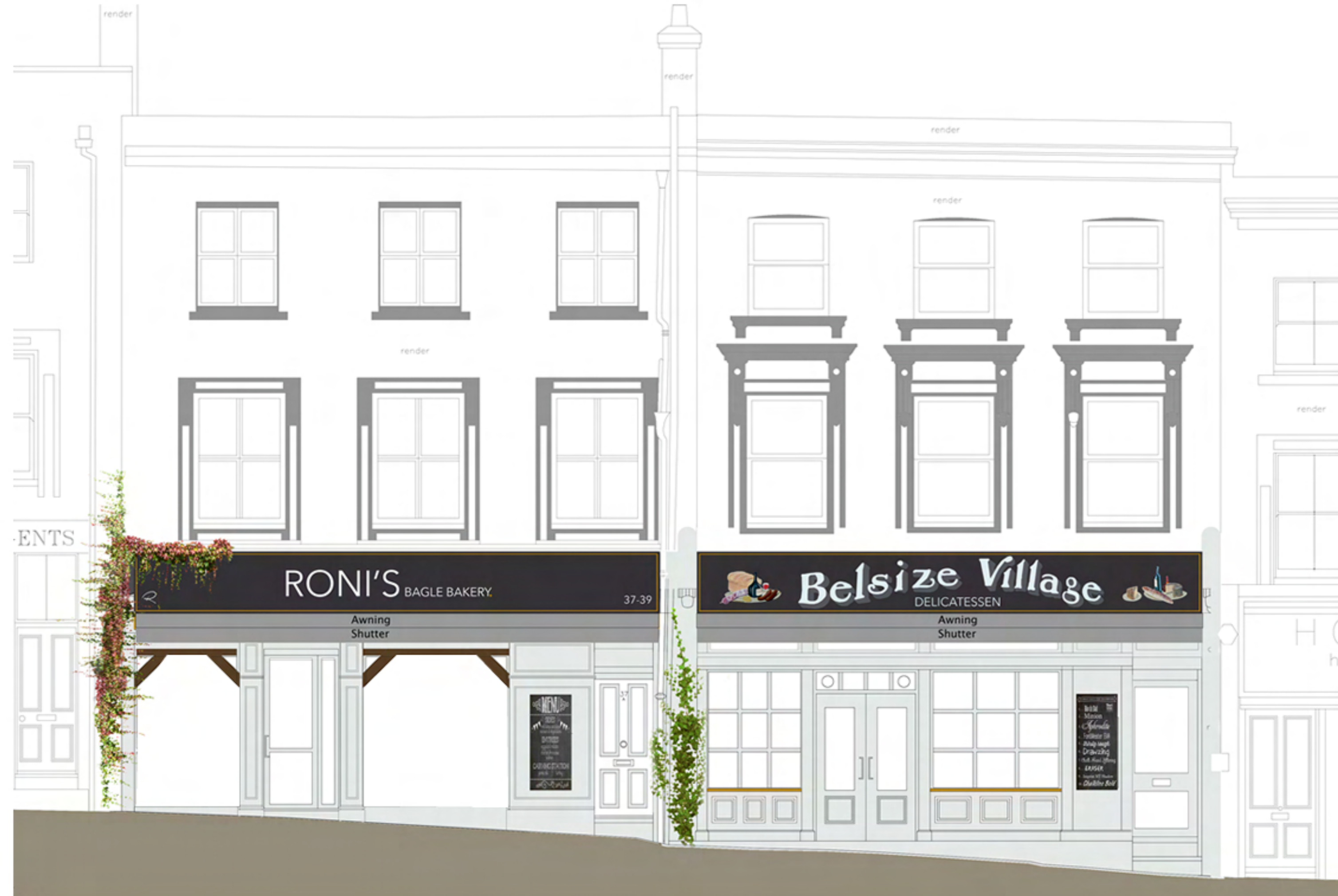
WEST ELEVATION (BELSIZE LANE) A.O.D. 62.00m

THE CO-ORDINATES ARE DERIVED FROM THE ORDNANCE SURVEY ACTIVE STATION NETWORK OSTN15 (BASE STATION ST04)