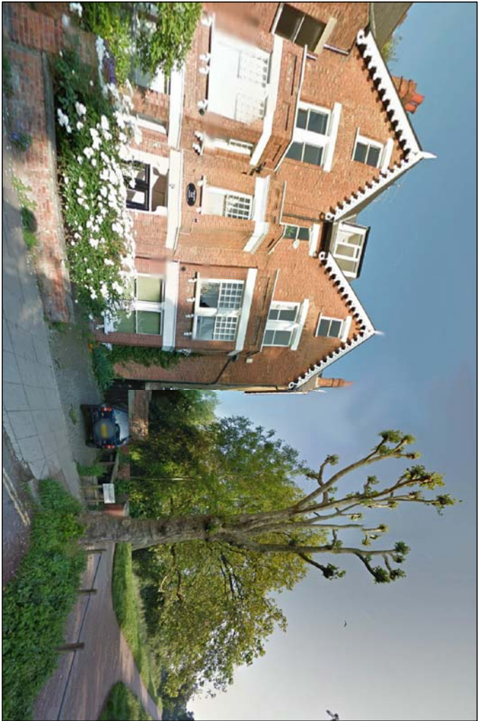
VIEW OF FRONT ELEVATION SHOWING TREES