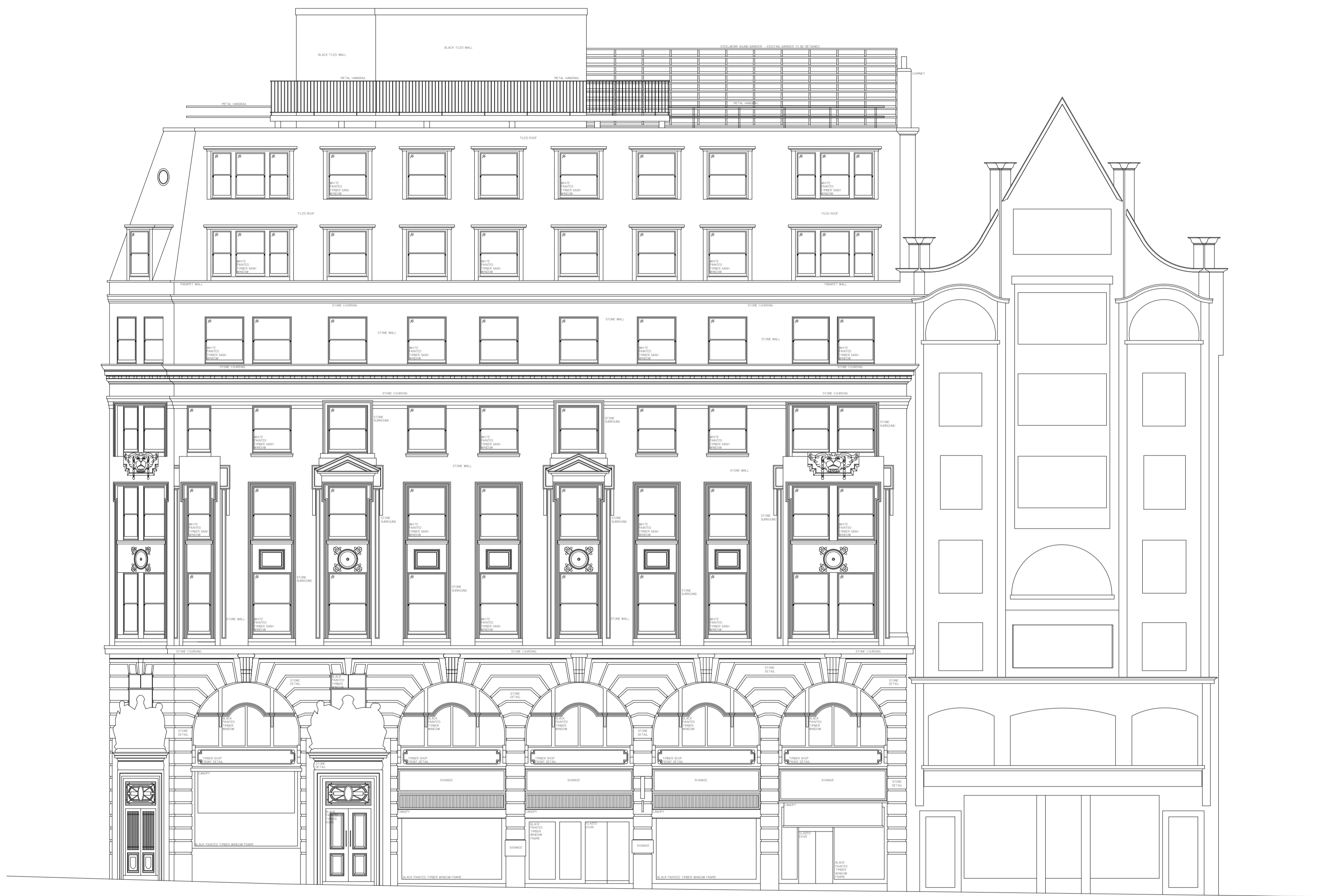
5M LINE SOUTHWEST ELEVATION 1:100 SCALE

NOTE: AREAS DRAWN INDICATIVELY NOTED AND INDICATED BY GREY DASHED LINE AS LINE BELOW -----