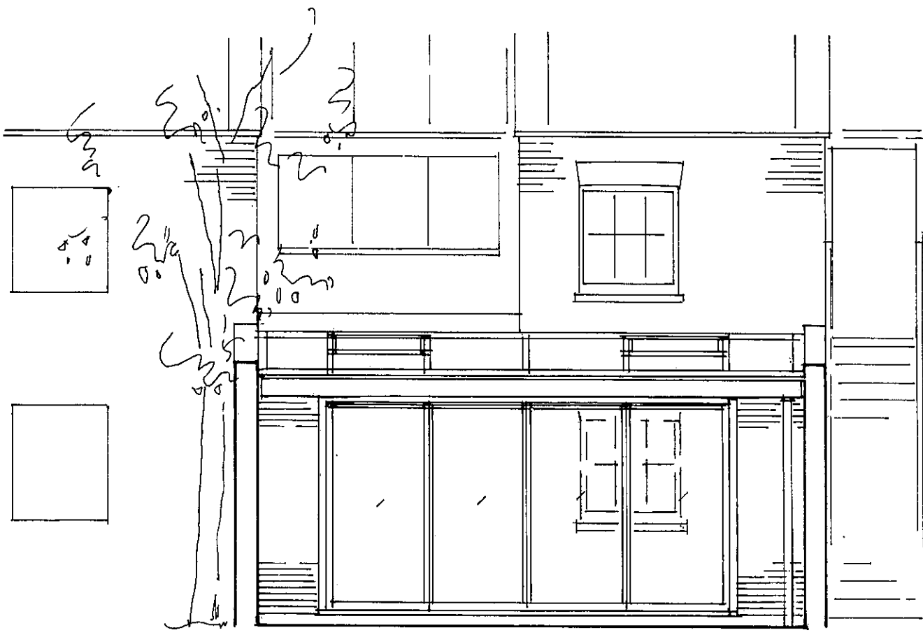
VIEW FROM GARDEN 4M OPENING FOR GLAZED DOORS ONE PASS DOOR + 3 FOLD/SLIDE