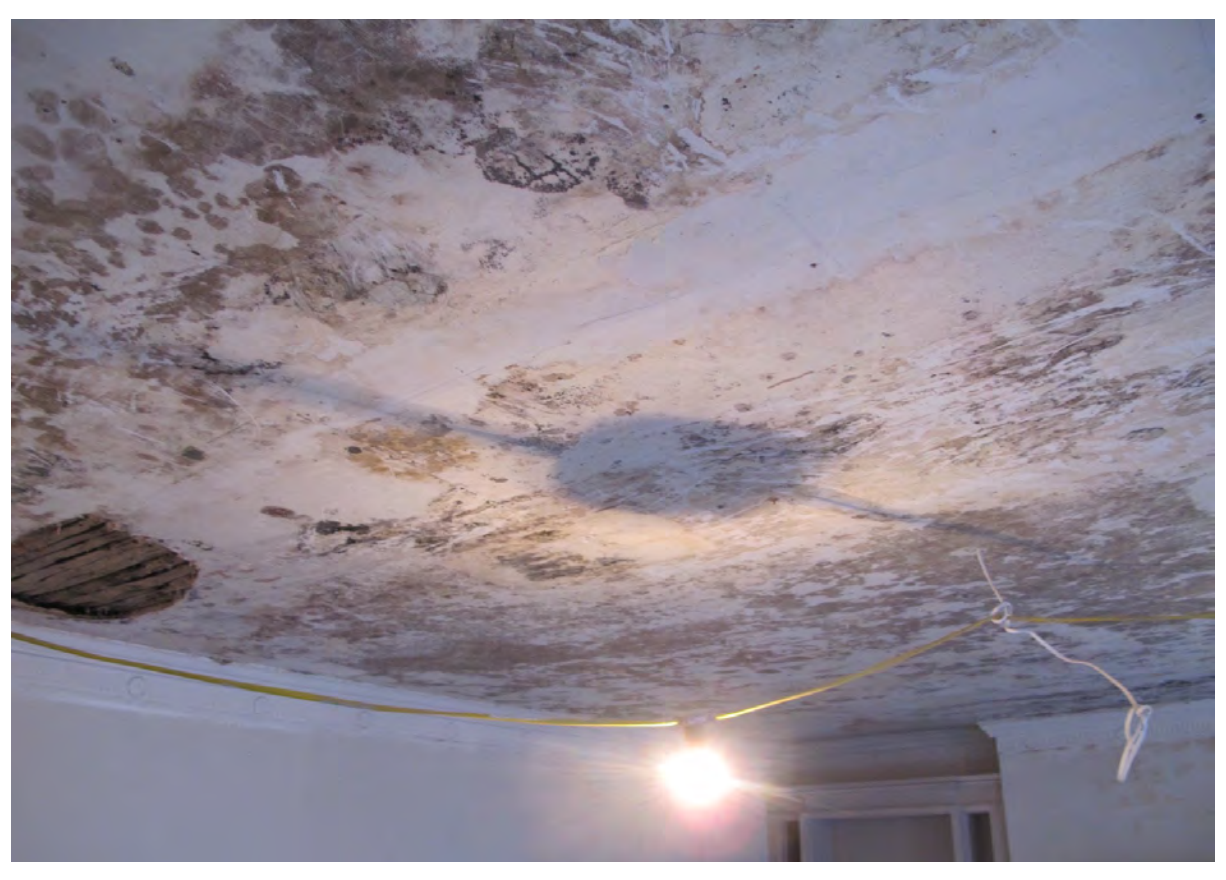
Fig. 2.2B Removal of over-boarding, revealing mould growth and water damage to original lime plaster and lath ceiling