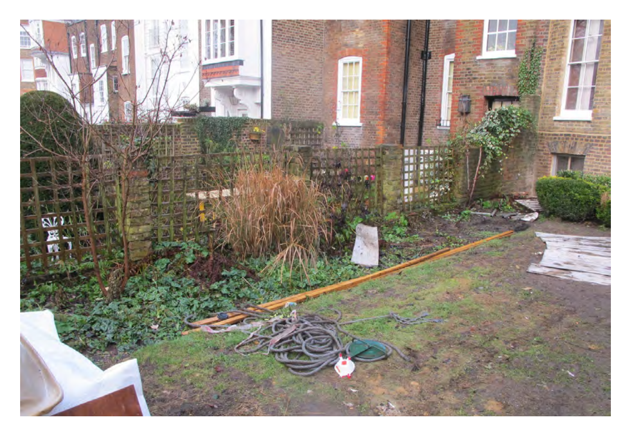
Fig. 4.1A Existing boundary