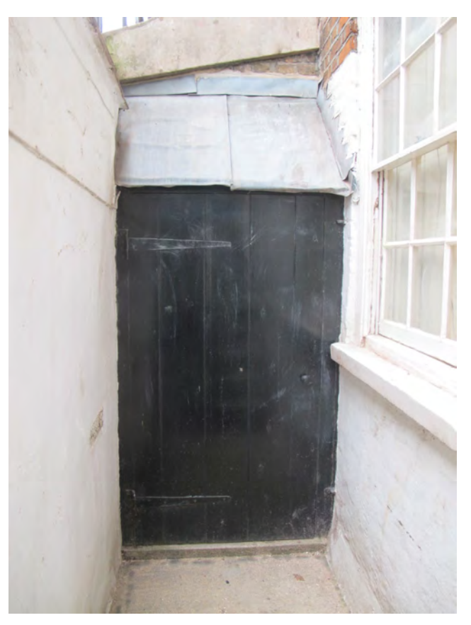
Fig. 3.1A Existing basement entrance door, external view