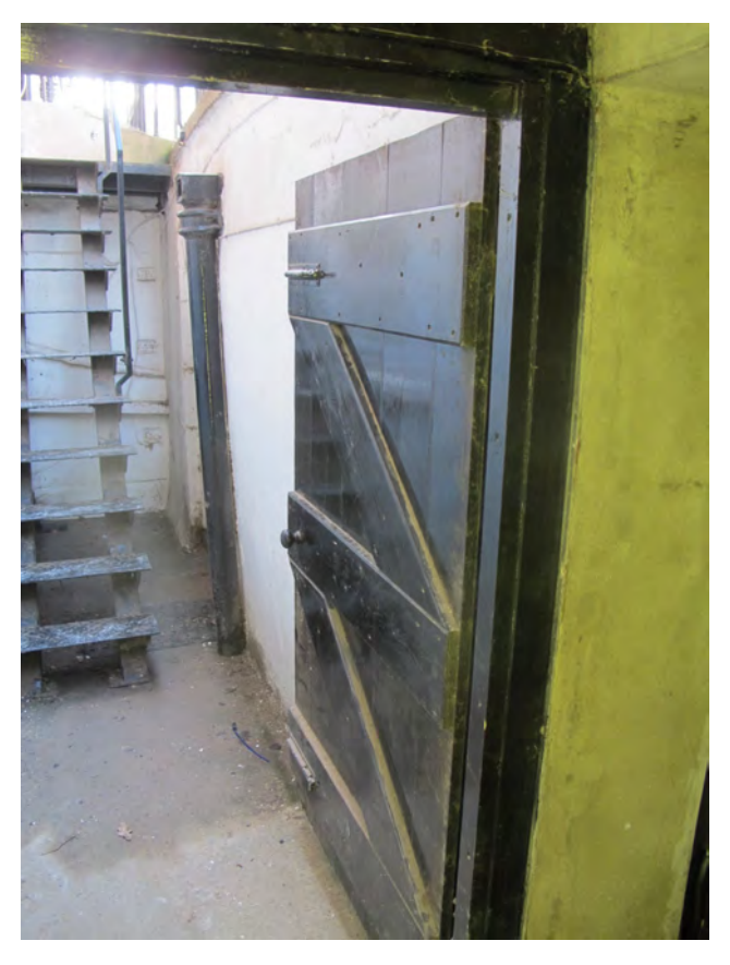
Fig. 3.1B Existing basement entrance door, internal view