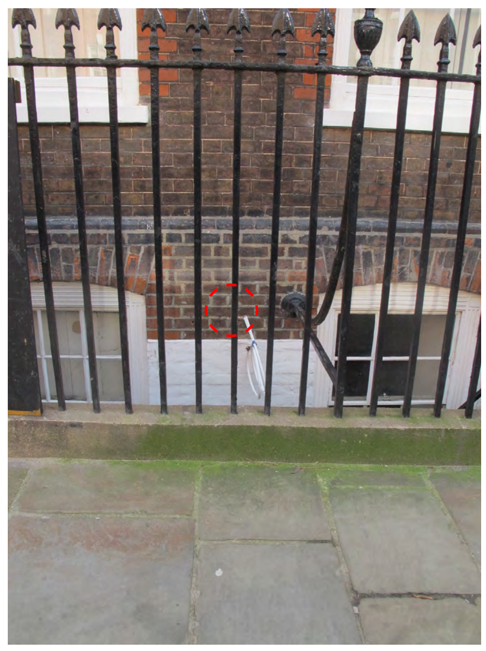
Fig. 3.3A Proposed burglar alarm location