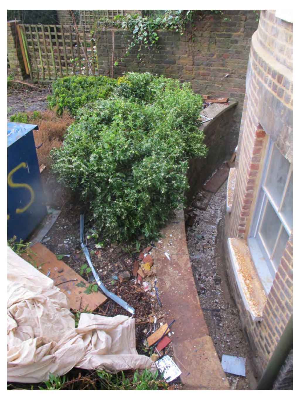
Fig. 4.3A Existing rear lightwell, unprotected edge