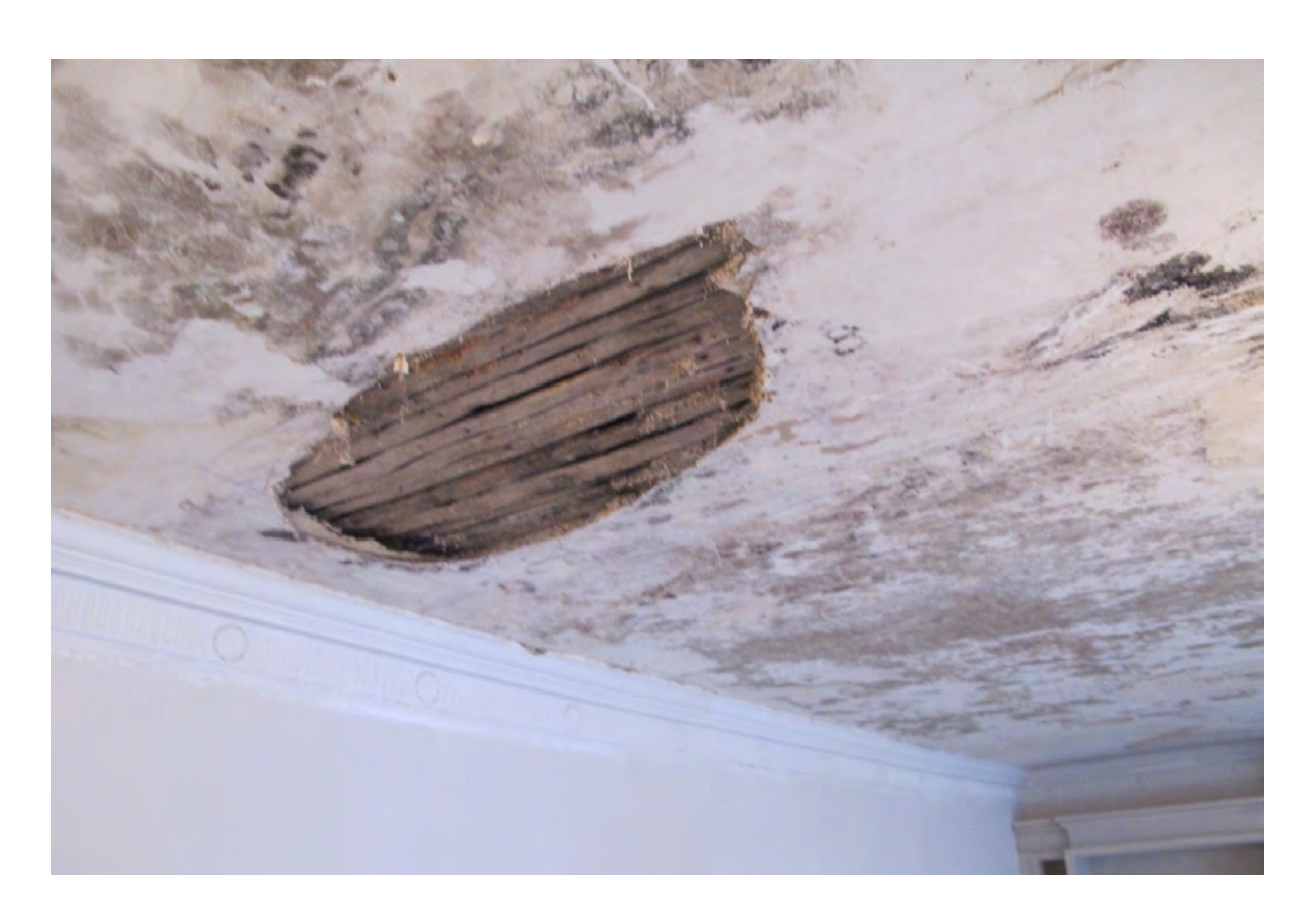
Fig. 2.2C Water damage and failing lime plaster ceiling