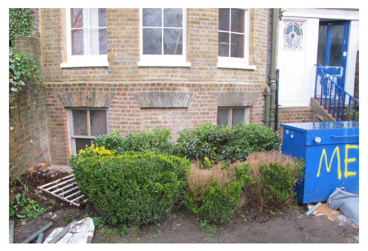
Fig. 4.2A Rear of house showing basement lightwell