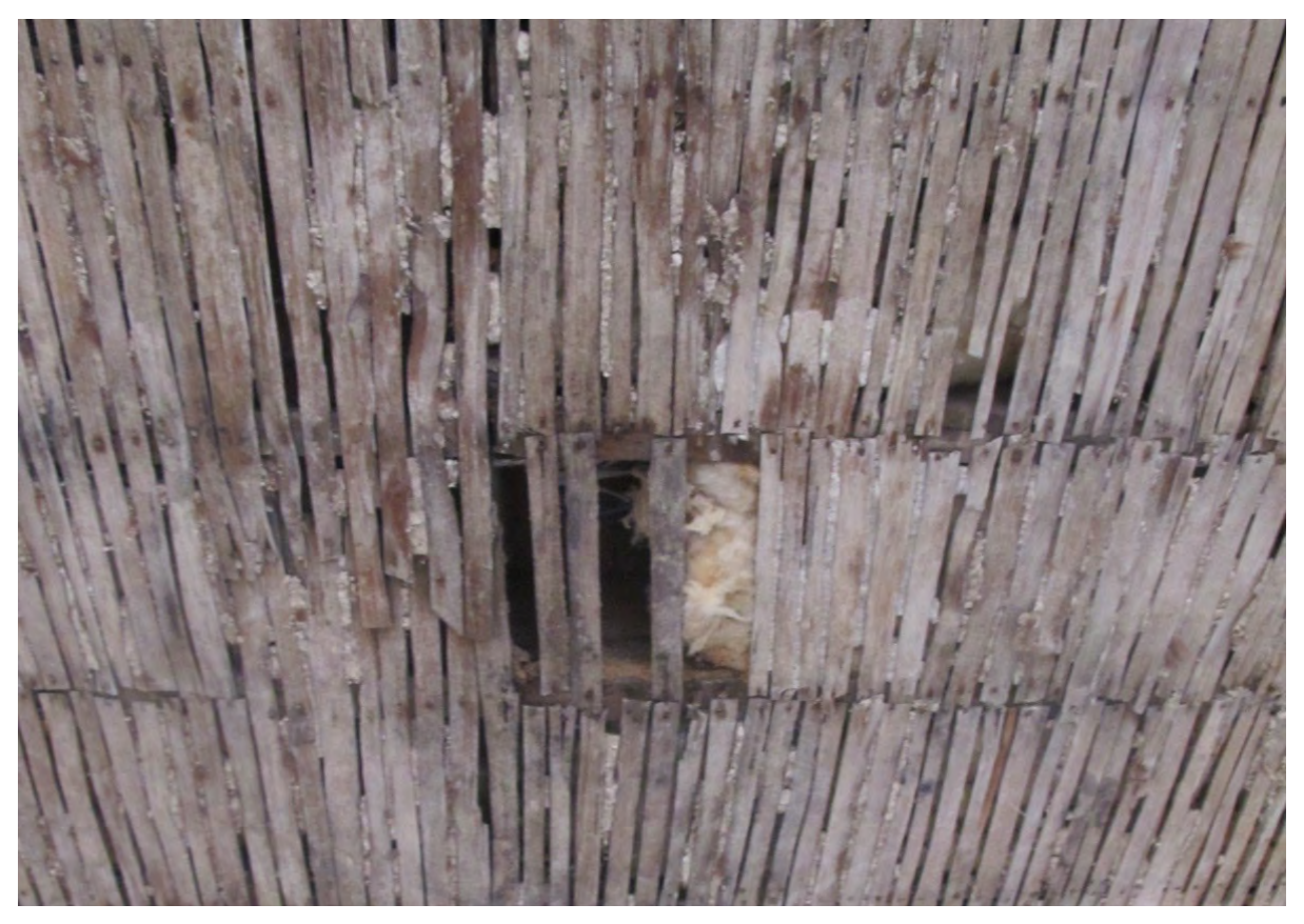
Fig. 2.2D Frail and water damaged lathing [Note laths also set tightly together]