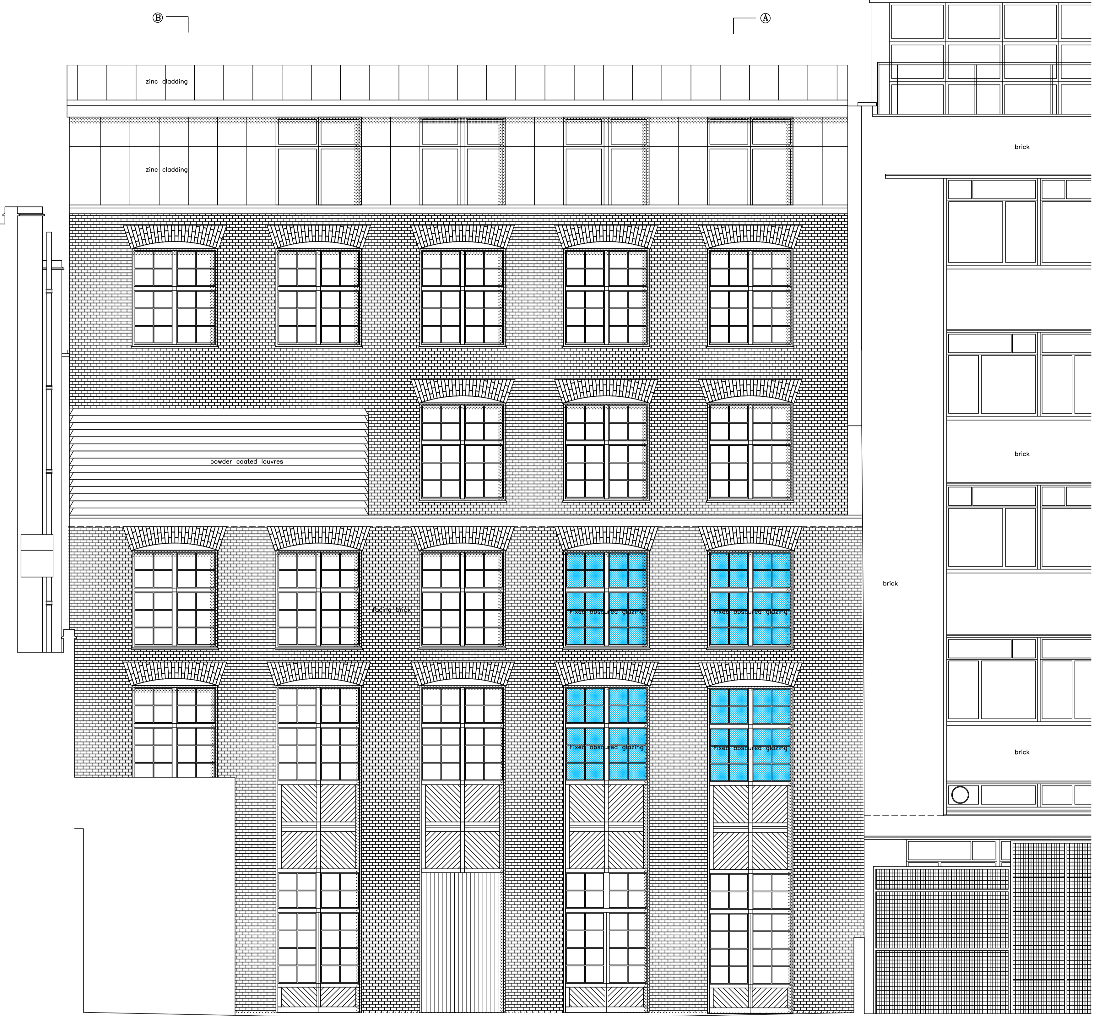
NORTH EAST ELEVATION (BAYHAM PLACE) \pm 22.00m A.O.D.