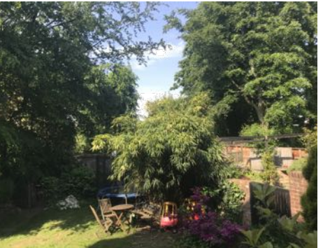
existing site photographs