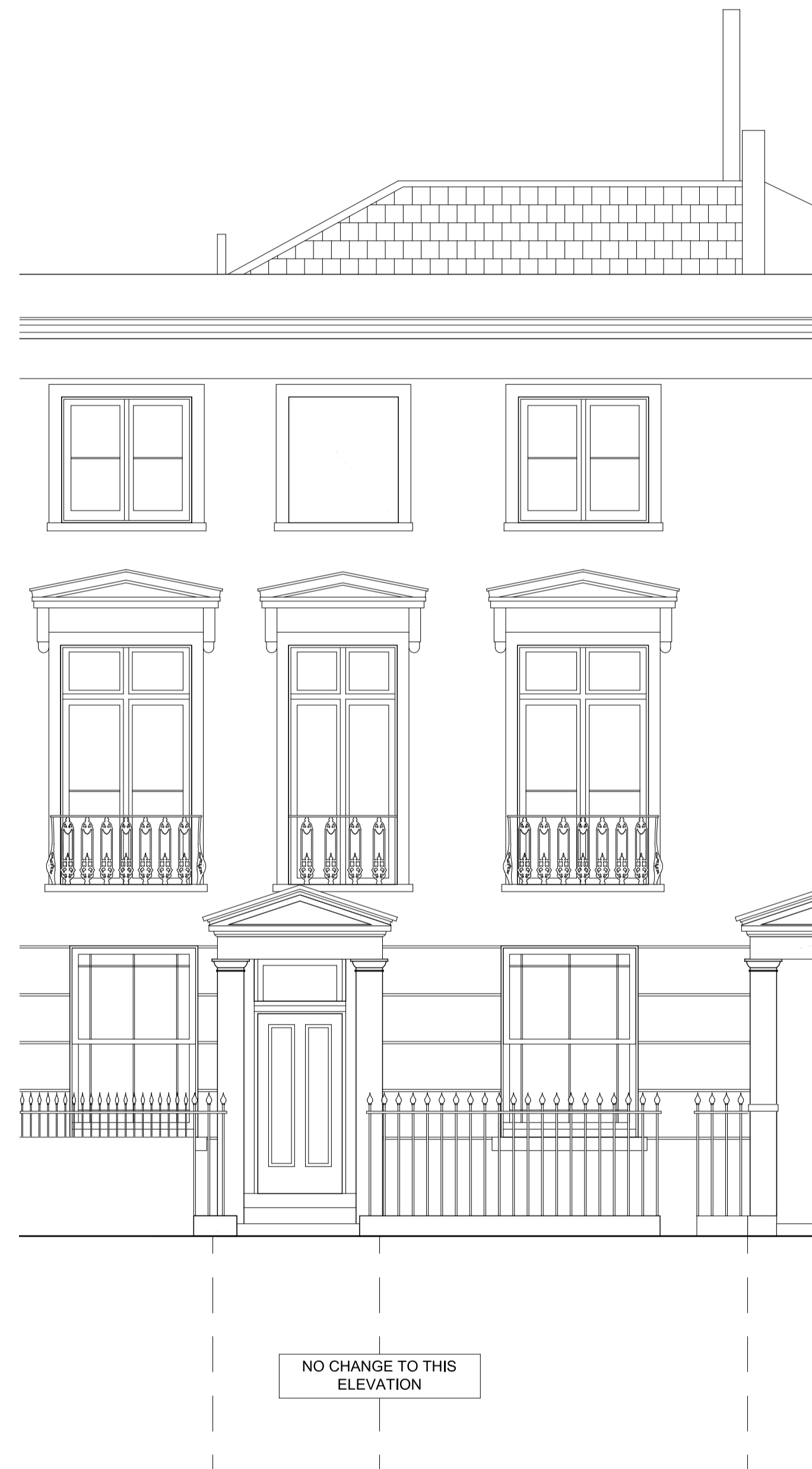
1 FRONT ELEVATION (North) PROPOSED