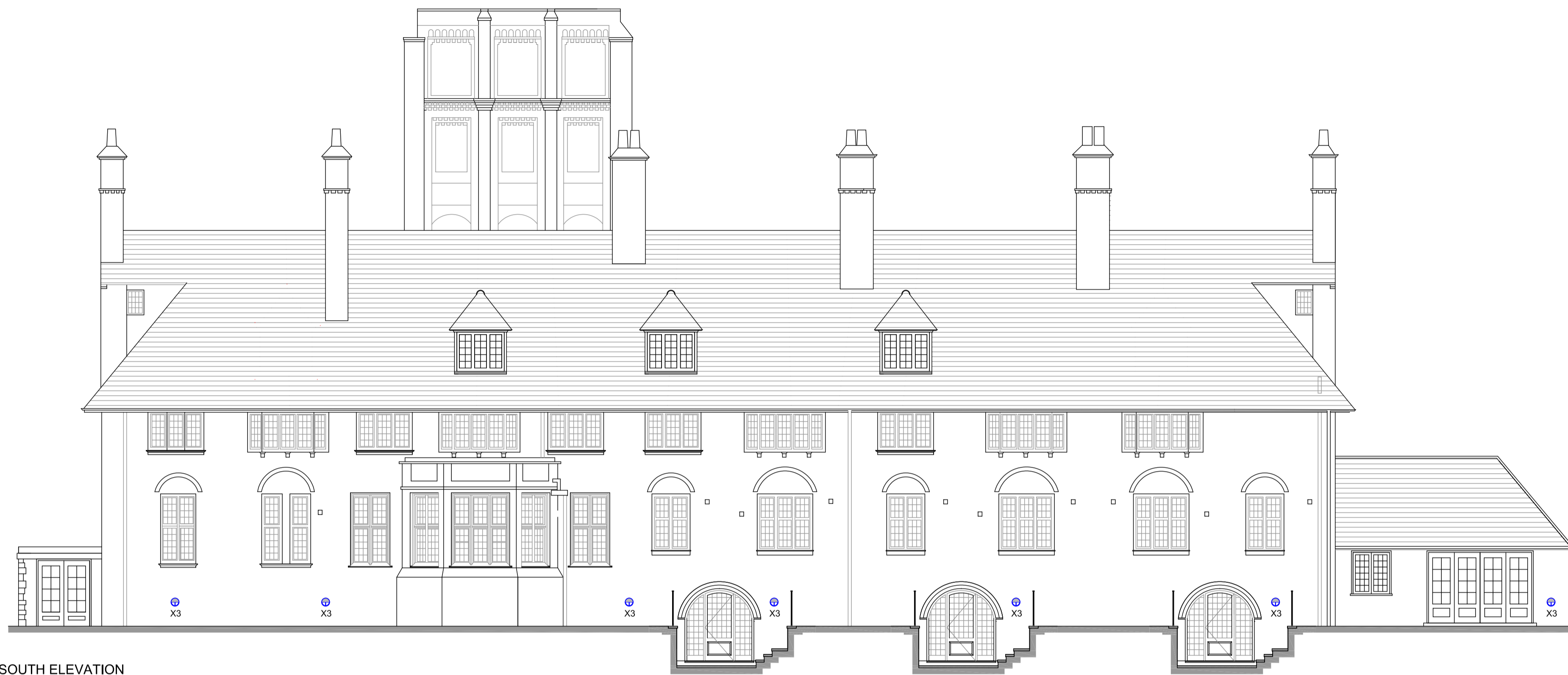
SOUTH ELEVATION SCALE 1:100@A1