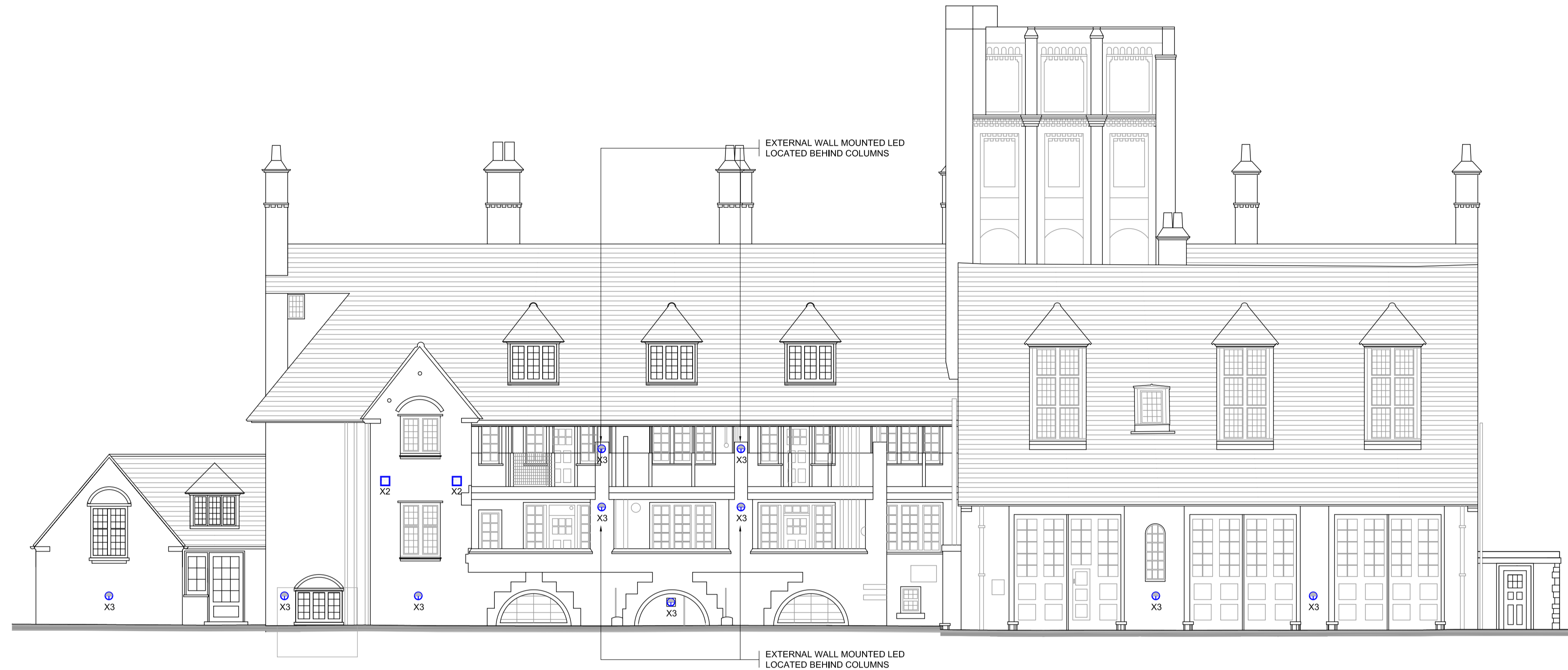
NORTH ELEVATION SCALE 1:100@A1