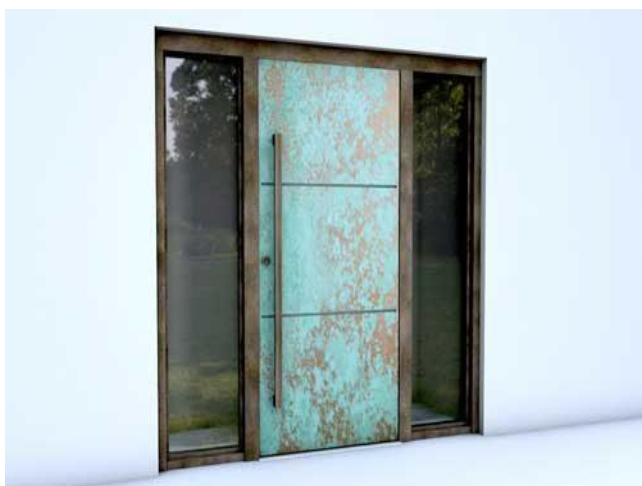
Copper Patina Door -