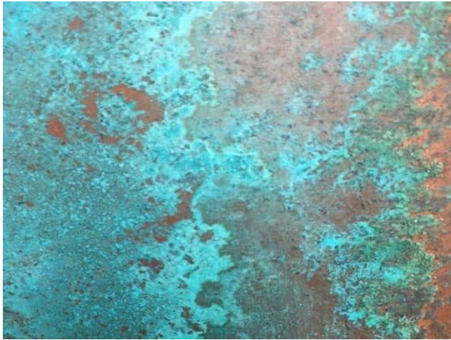
Patina Copper - Copper Patina