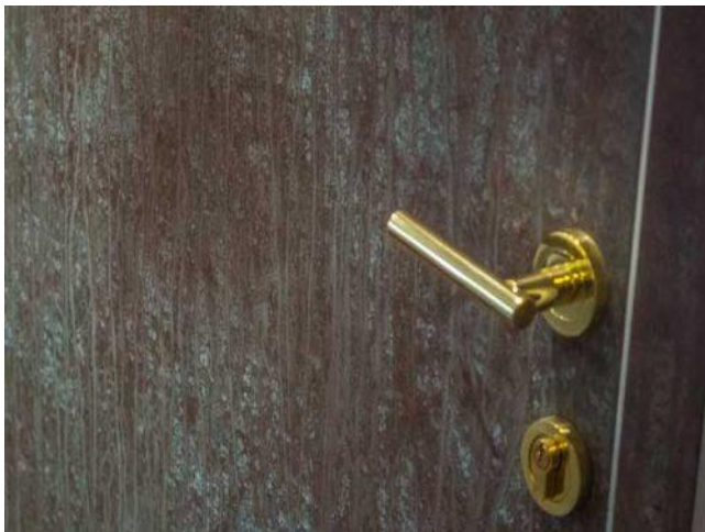
Copper Patina Door -